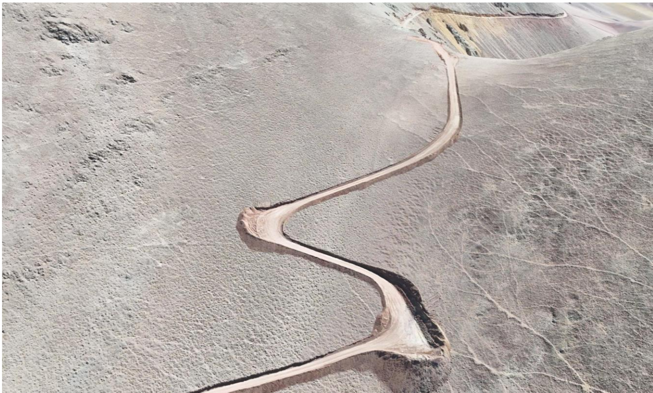
Figure 1 - Section of the newly constructed access track to Malambo drill targets.