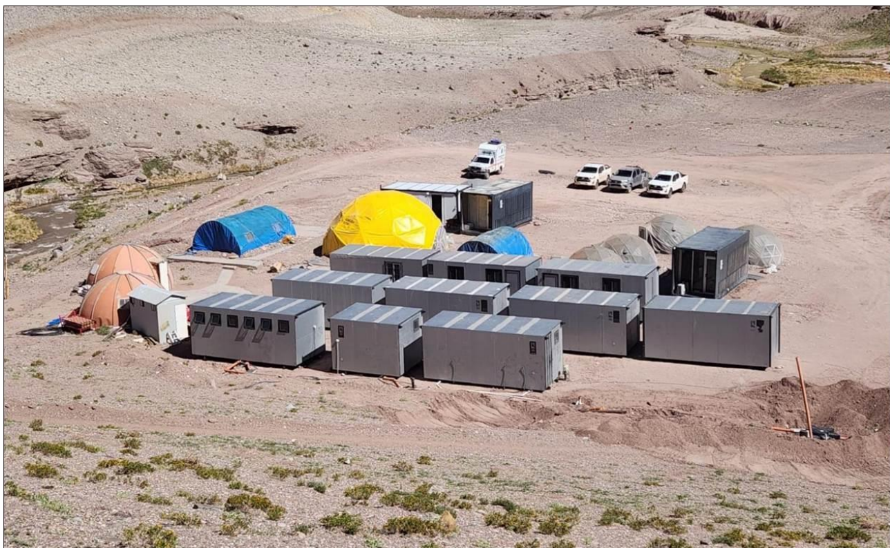
Figure 5 - TMT Camp is now ready for 55 persons fully furnished.