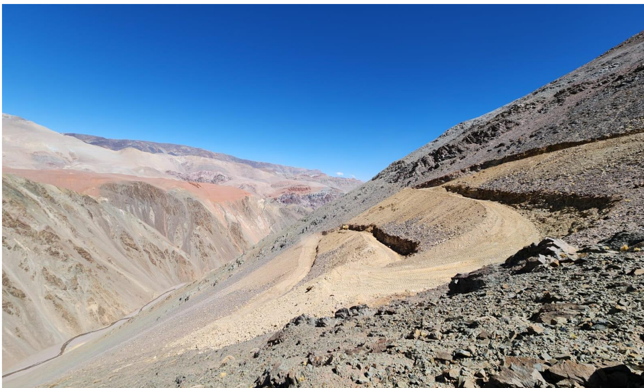
Figure 2 - Malambo access track through one of the rocky sections.