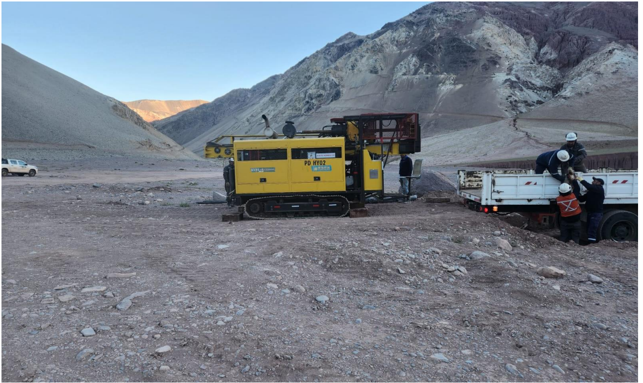
Figure 3 - Arrival of the first of Conosur's drill rigs at the TMT project.