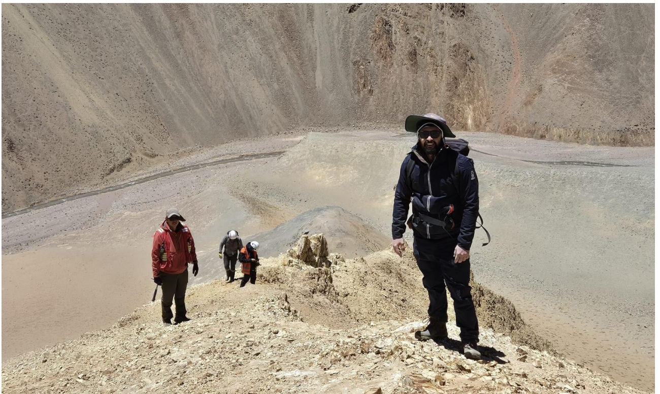
Figure 4 – Regional team at the Malambo target.