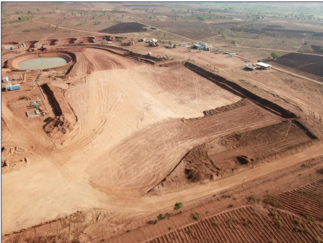
Figures 3 & 4: Test pit during hydro-mining trials (above) and aerial view of test pit being backfilled