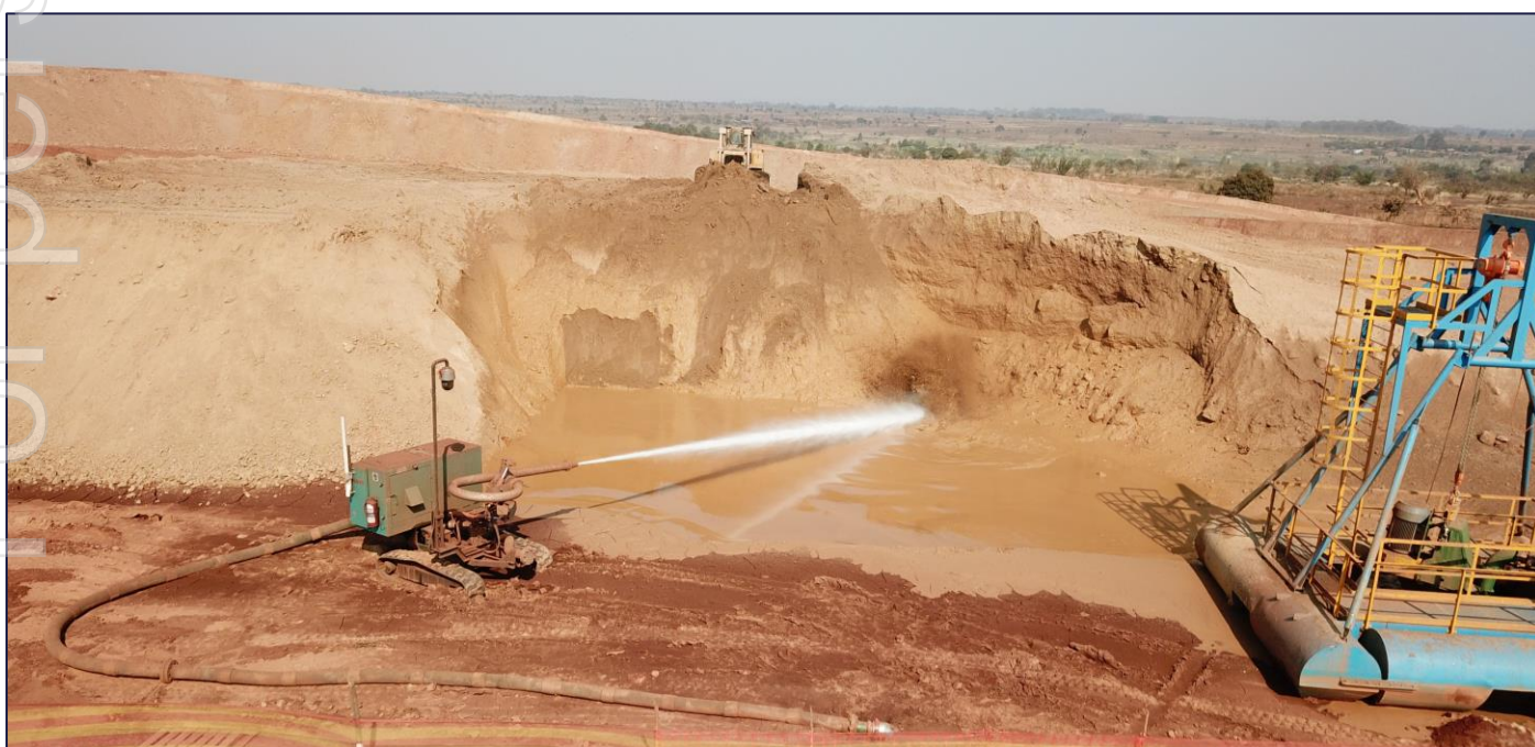
Figure 2: Water monitor demonstrating hydraulic mining of Kasiya material