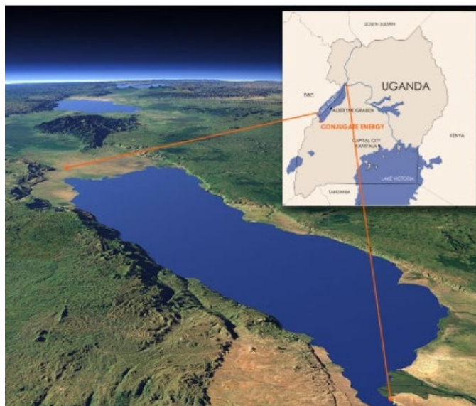
The Albertine Graben showing its location in Uganda.

The Kingfisher oil discovery (40km NE of Kanywataba) oil seeps confirm a local working petroleum system.