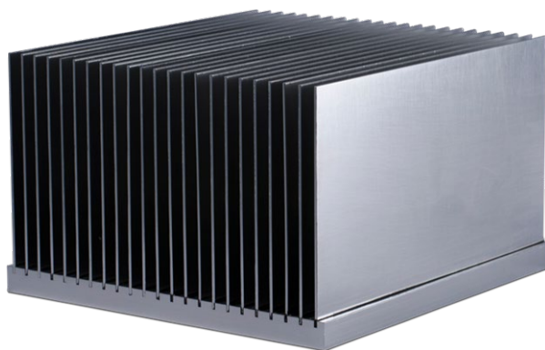
Figure 2 - Example of Commercial Graphite Heat Sink

As electronic devices become more powerful, the need for efficient thermal management is paramount. Overheating can reduce the lifespan of electronics and compromise their performance. VHD Graphite, with its record-breaking thermal conductivity, and 100% structural alignment (enabling directional and efficient funneling of heat), and machinability can be used as heat sink material in high-performance computing, semiconductors, data centres, AI, and consumer electronics . Its ability to rapidly dissipate heat makes it an attractive solution for industries that require high-efficiency cooling . VHD Graphite heat sinks afford for smaller heat assemblies due to its high efficiency thermal performance