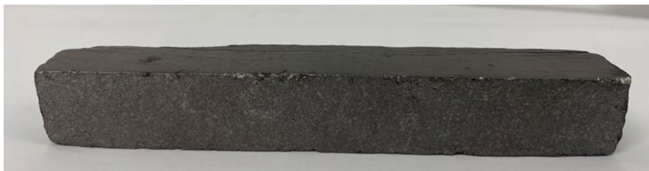
Figure 1 - VHD Graphite Block Produced from the Proprietary Cerex Inventor Process

With the acquisition of the groundbreaking VHD Graphite technology, GCM is positioned to make significant strides in the global market for graphite-based products. This breakthrough technology, developed by leading researchers at the UNSW represents a quantum leap in both the properties and applications of graphite. It offers unique performance characteristics that have the potential to transform high-value industries, from semiconductors to heat management systems to industrial energy storage to EDM to batteries and fuel cells and to nuclear .