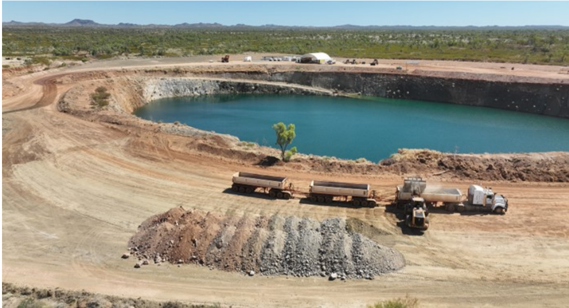
Figure 1. First Ore Haulage from Wallace North.