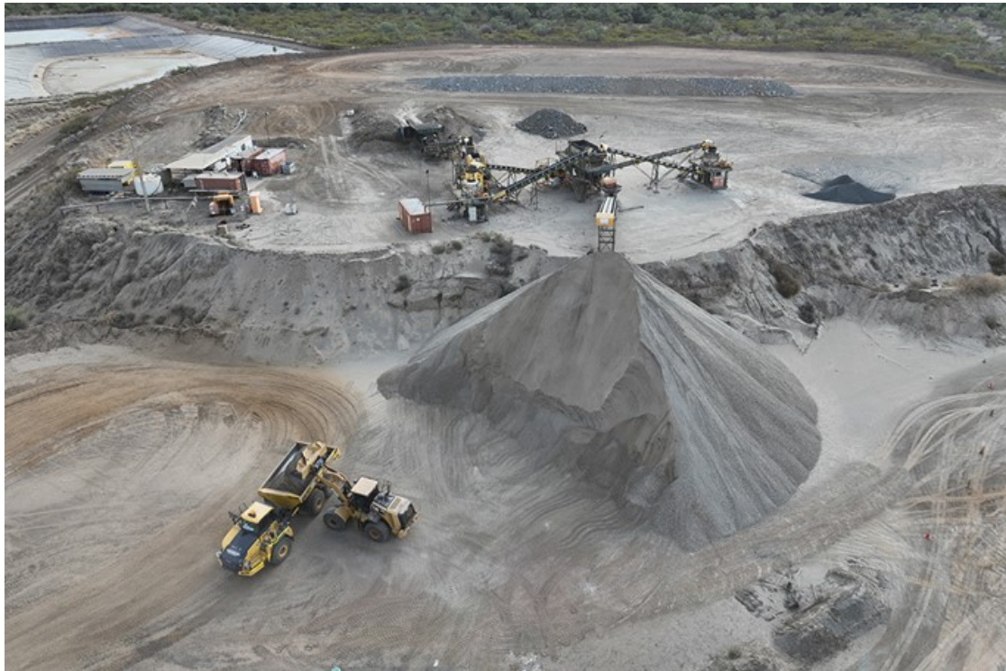
Figure 2. Recovery of crushed stockpiles for transport to the leach pad.