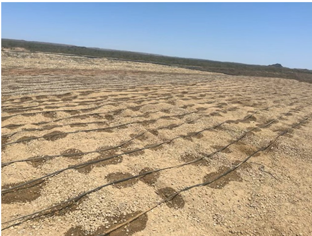
Figure 3. Leach pad 5 under irrigation.