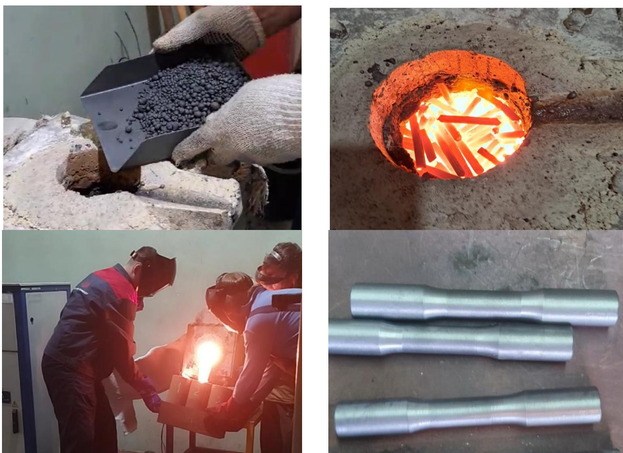
Figure 1 – Manufacture of Grey Cast Iron with Agglomerated Sarytogan "Micro80C" Graphite.