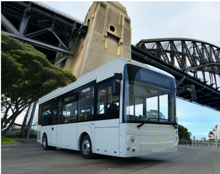
A similar version of the EV80 Electric Bus to be supplied

Sydney, 24 October 2024: As an update to its announcement released on 23 October 2024, Australian clean energy company Pure Hydrogen Corporation Limited (ASX: PH2 or 'Pure Hydrogen') is pleased to announce the entry into three separate agreements which collectively will comprise the sale of three HFC minibuses, two HFC coaches, two EV80 electric buses, extensive hydrogen refuelling infrastructure and two single vehicle chargers.