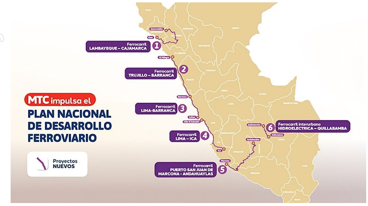
Figure 2 – Map of Peruvian Government's planned railway network expansion

The Marcona-Andahuaylas Railway Project is projected to cost USD$8.16 billion and is proposed to be executed under a Government to Government (G2G) scheme. Following the technical sign-off by the Peruvian Government, the Peruvian Minister for Transport and Communications (MTC) has made a number of positive comments highlighting the importance of the Marcona-Andahuaylas Railway Project including confirming interest from the Chinese Government after a recent state visit to China led by President Dina Boluarte.<sup>7</sup> Interest in the Marcona-Andahuaylas Railway Project has also been received from governments of Canada, France and Germany.<sup>8</sup>