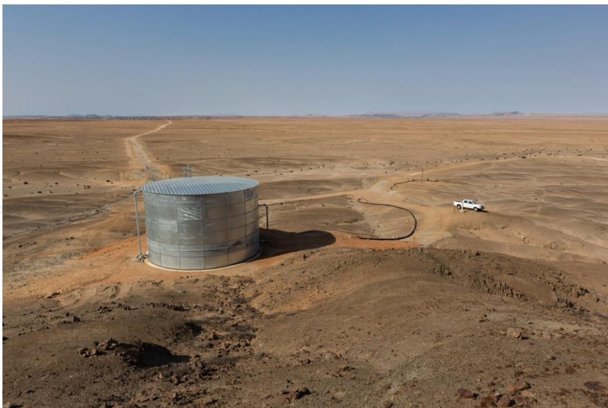
Figure 3: Completed construction water reservoir delivering 700m 3 storage volume