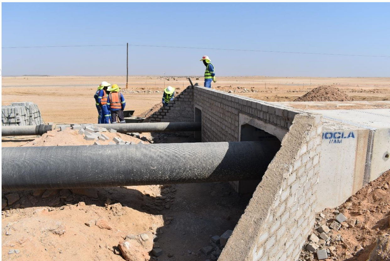
Figure 2: New culvert installed over the existing water supply pipelines