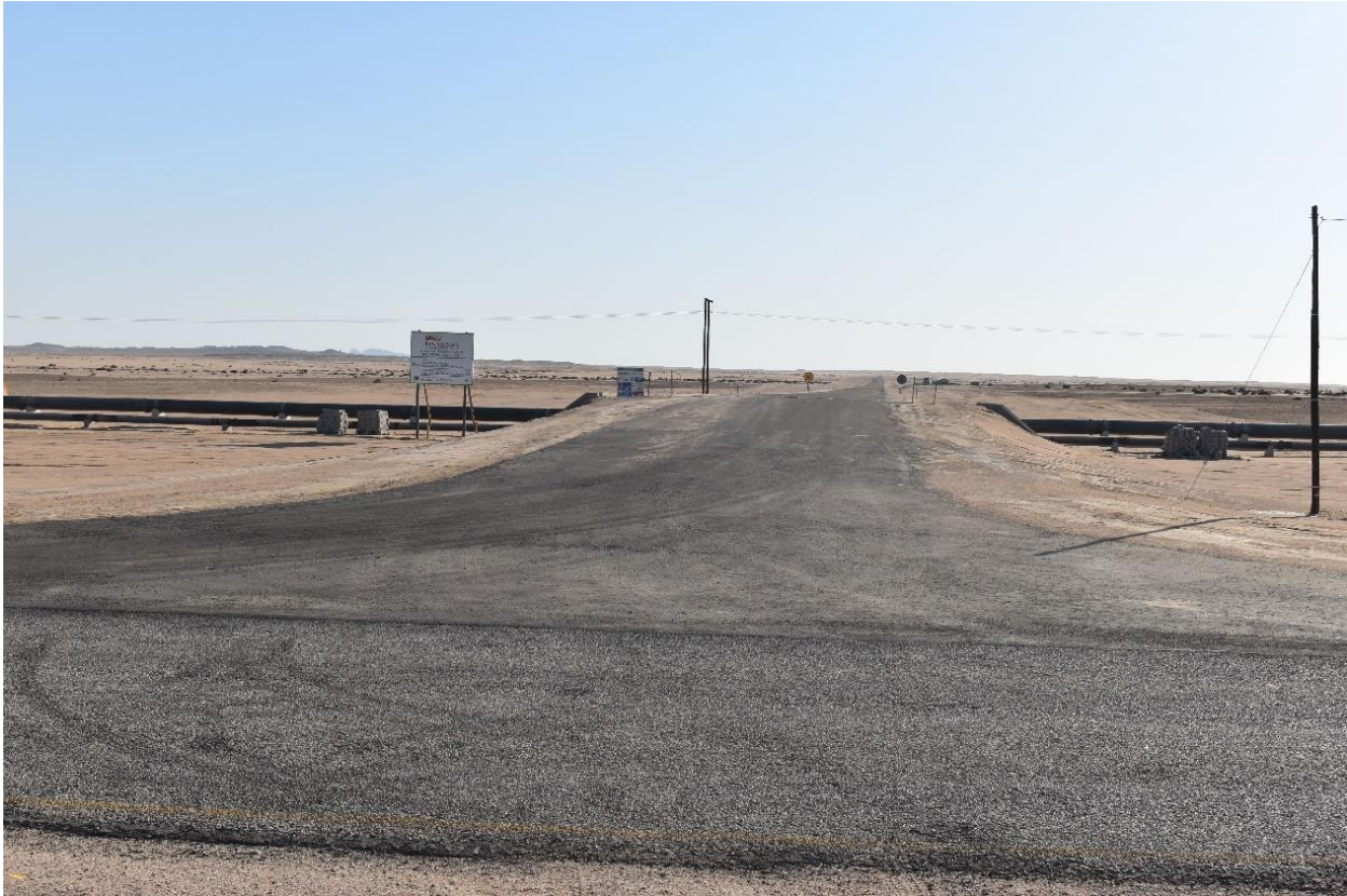
Figure 1: Completed access road to Etango site, showing the junction to the C28 tar highway

The first two early works contracts approved for Etango – the construction water supply and site access road – were completed in July; safely, on time and on budget. Bannerman thanks its local contract partners for their strong and safe performance on these projects.