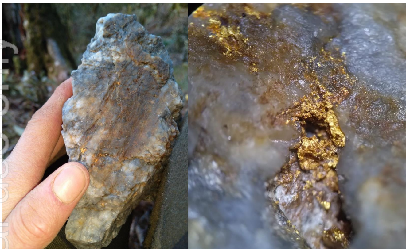
Figure 1. Victory United Reef float sample.