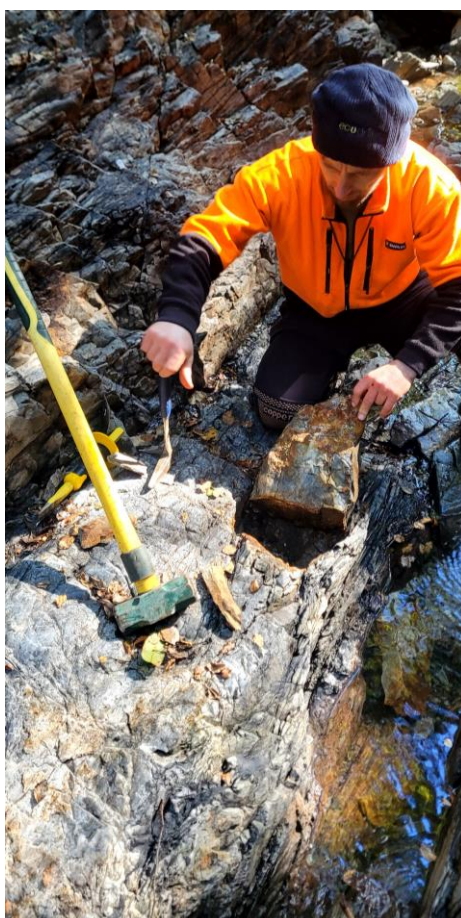
Figure 3. Resampling of the Victory United Reef.