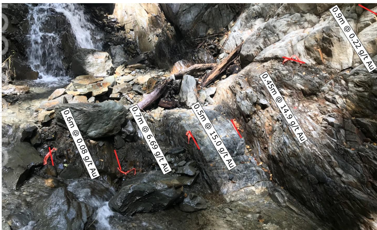
Figure 2. Victory United Reef -Trench LYTR005.

Resampling of the quartz reef outcrop was completed in August 2024 with seven samples collected (Figure 3). The samples assayed 127g/t Au, 123g/t Au, 114 g/t Au, 47g/t Au, 13.4 g/t Au, 10.7g/t Au and 8.3g/t Au, averaging 63g/t