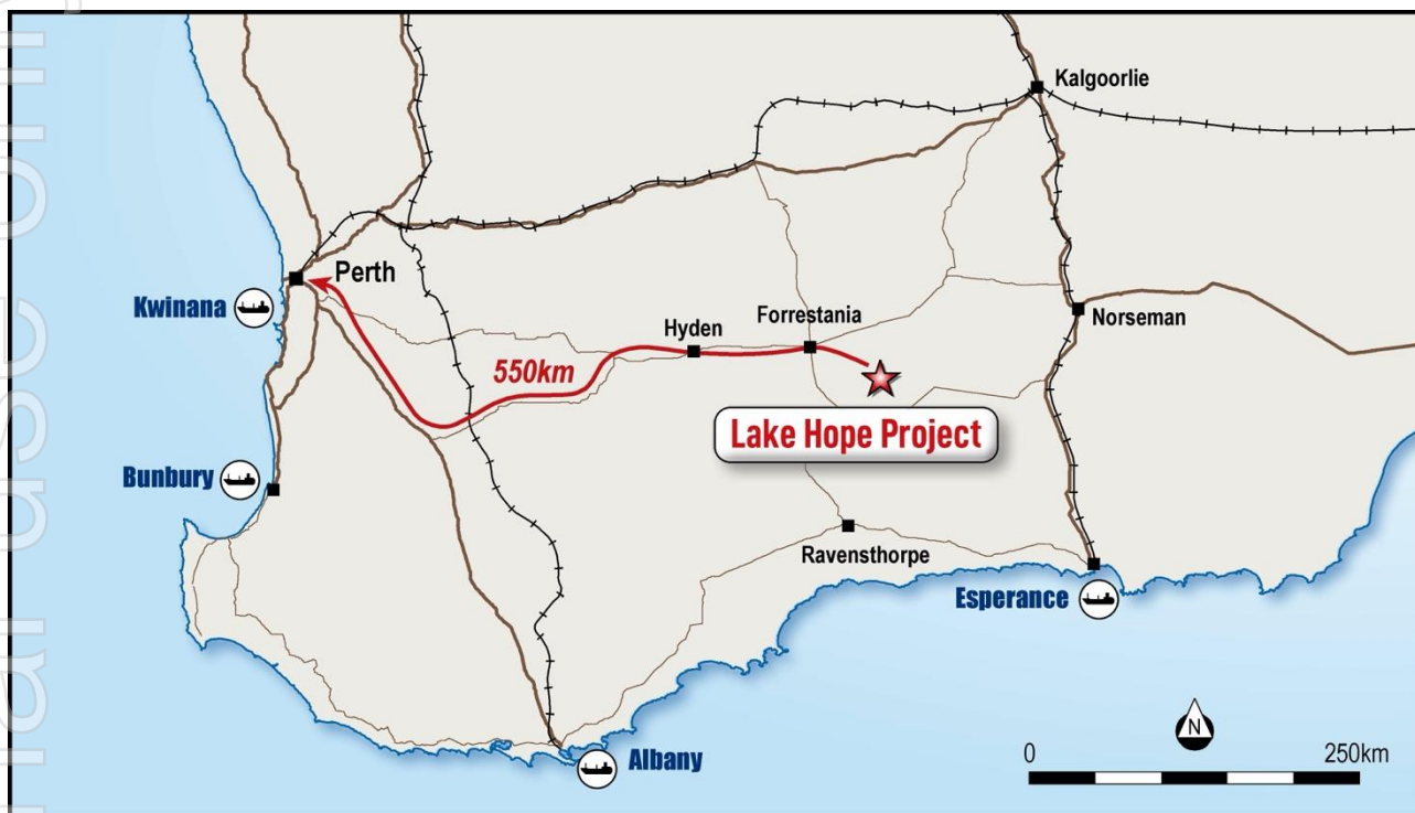
Figure 1. Location of the Lake Hope Project and proposed haul route to Kwinana.

Recent ASX releases by Alpha HPA Limited (ASX:A4N), a leader in the HPA industry, show significant global demand for a wide range of HPA products with indicative interest from potential clients of more than 30,000 tonnes per annum. This is well over Alpha's planned production of 10,000 tonnes per annum and indicates the underlying strength of the HPA market, which is estimated to be growing at an annual compound growth rate of 15% to 20%. Impact's marketing strategy will be to identify specific market entry points where the HPA from Lake Hope can deliver the greatest value in use for end-users.