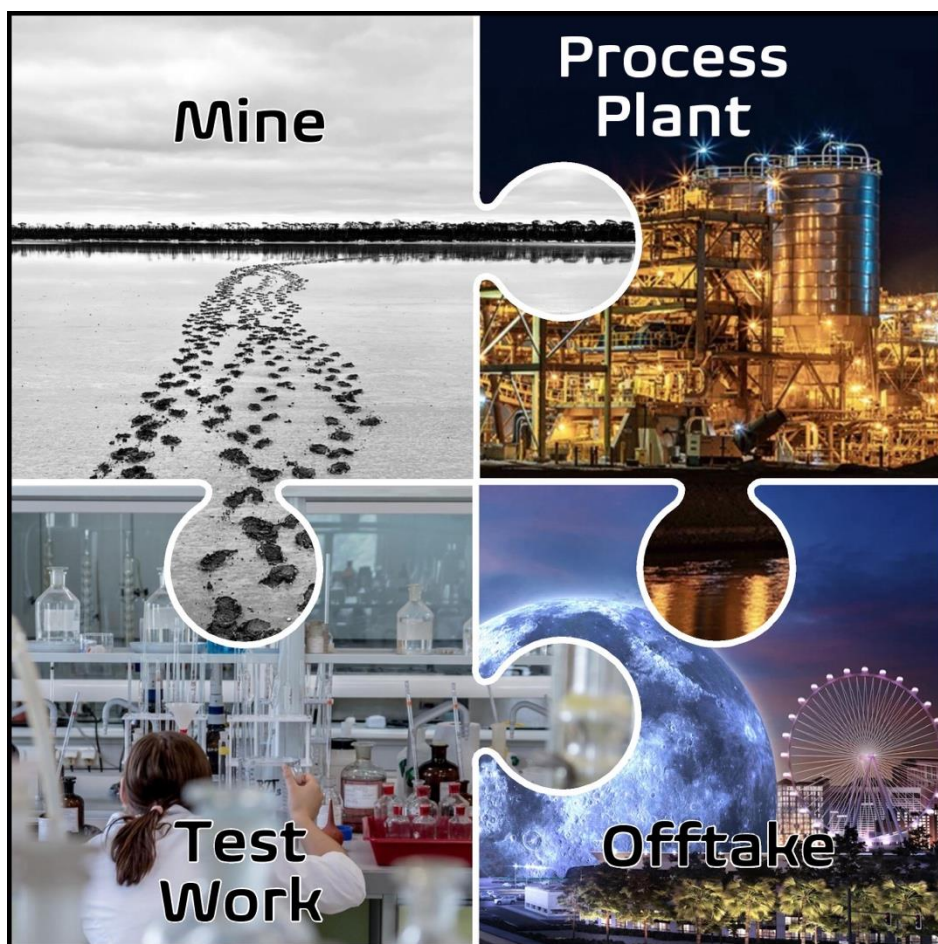
Figure 2. The four pieces of the Lake Hope Pre-Feasibility Study Jigsaw Puzzle.

The appointment of the Marketing Manager continues to add to the significant progress being made on the four main parts of the PFS for Lake Hope: the proposed mine at the lake itself; test work to optimize the metallurgical process; the associated planned full-scale 10,000 tonnes per annum process plant; and marketing, product development and offtake agreements for the final HPA products (Figure 2 and ASX Releases July 10 th 2024 and August 12 th 2024).