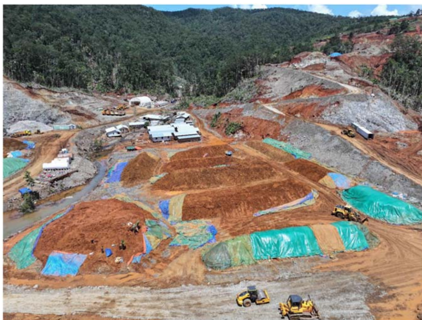
Photo 1 – Kolosori Project Site and stockpiles located near to the Kolosori Wharf

During the first half of the Reporting Period, the Kolosori Project was constructed with the first ore mined on 1 October 2023. The first shipment of ore (approximately 60,000 tonnes) was achieved in late December 2023. The first shipment achieved design grade of over 1.7% Ni and was loaded at rate required for the forecast 1.5mpta operation.