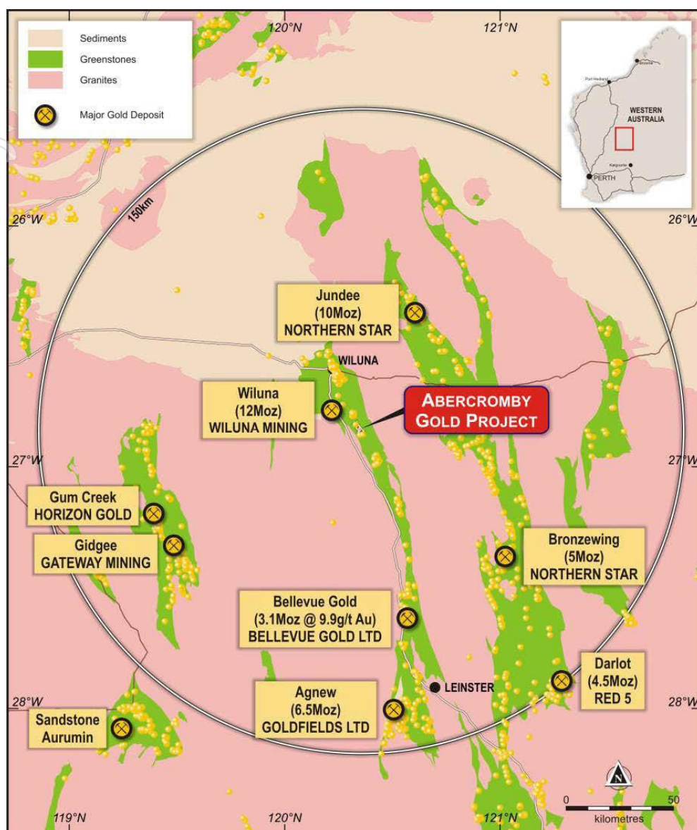
Figure 1 – Regional map of the Abercromby Project with nearby major gold mines highlighted.

The maiden resource for Abercromby comprises the Capital Deposit which remains open in all directions.