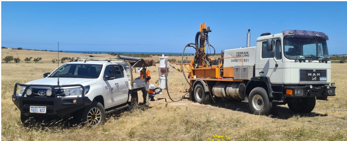
Figure 1: Port Gregory Project

HVY has maintained a strong focus on advancing the Port Gregory Project (Figure 1) by improving its resource definition and studying the feasibility of building and operating a garnet mine. In addition, HVY has continued work to improve the geological knowledge at its Red Hill project (Figure 2) developing a program of resource drilling that will bring resource definition to the next level following the announcement of an Exploration Target in May 2023.