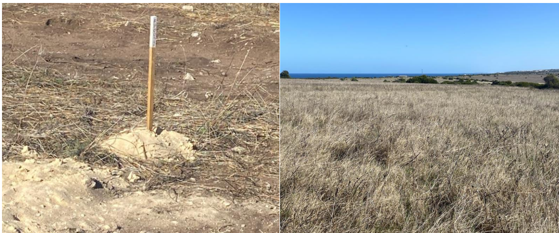
Figure 2: Red Hill Project

Heavy has also been undertaking work to design resource evaluation programs and gain land access to its regional tenements to determine the prospectivity of these tenements.