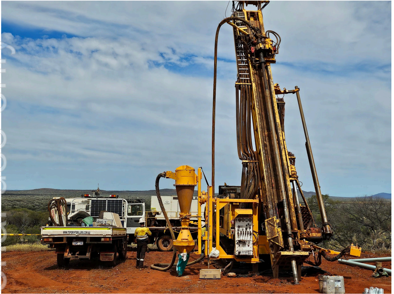
Figure 01: Reverse Circulation Drilling commencing on WARDH160 at the Remorse Target