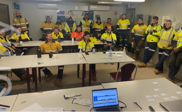
Laverton mill re-start - Safety meeting