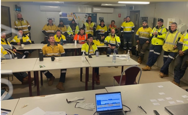
Laverton mill re-start - Safety meeting