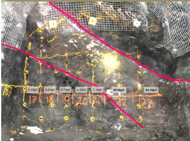
Ulysses underground - High grade ore development underway