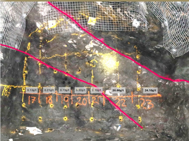
Ulysses underground - High grade ore development underway