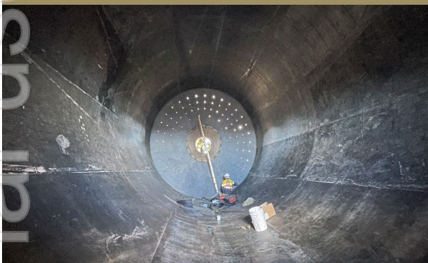
Laverton mill re-start - Ball mill relining