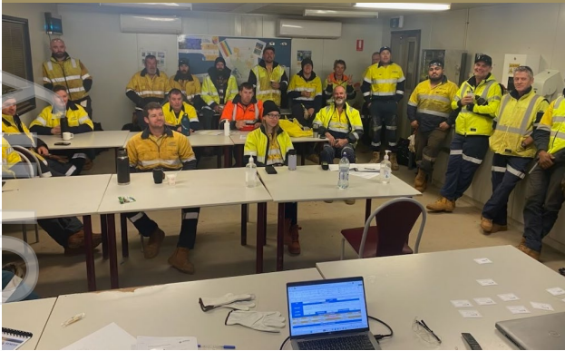
Laverton mill re-start - Safety meeting