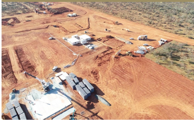
Hub open pit - Site infrastructure