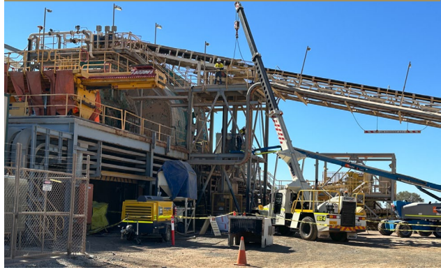
Laverton mill re-start - Conveyor change out