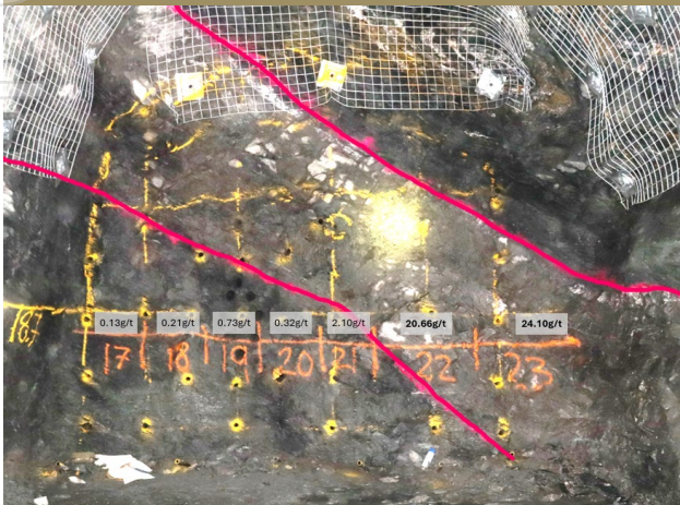
Ulysses underground - High grade ore development underway