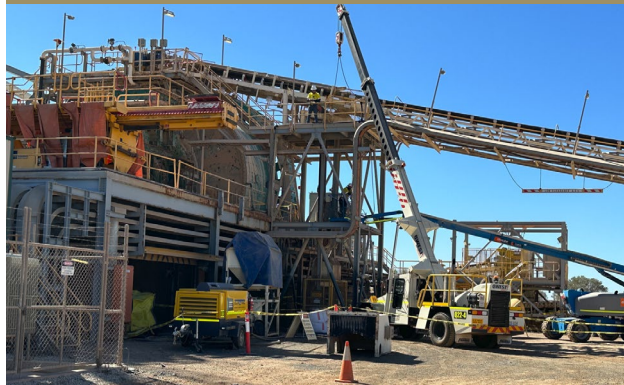
Laverton mill re-start - Conveyor change out