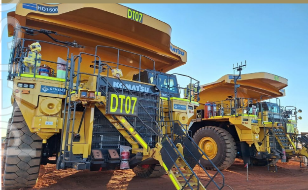
Hub open pit - New mining fleet