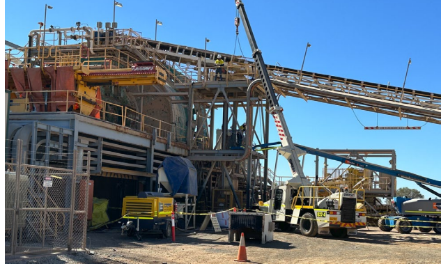
Laverton mill re-start - Conveyor change out