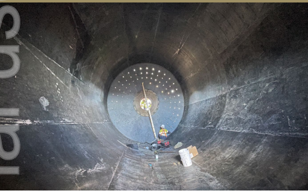
Laverton mill re-start - Ball mill relining