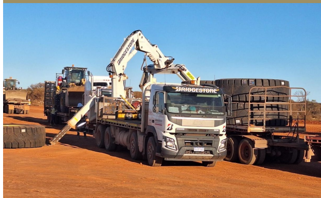
Hub open-pit - Bridgestone on site