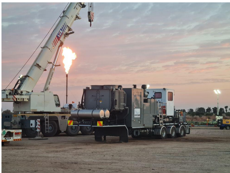
CTU preparing to move off Daydream-2 lease

The Daydream-2 well has now successfully had removed all the temporary plugs between its six separate stimulated zones. The Coil Tubing Unit (CTU) that undertook the work has been released to Elixir’s neighboring Operator. The well flowed gas and completion fluid back freely to surface once it was put onto test, without the need for any assistance.