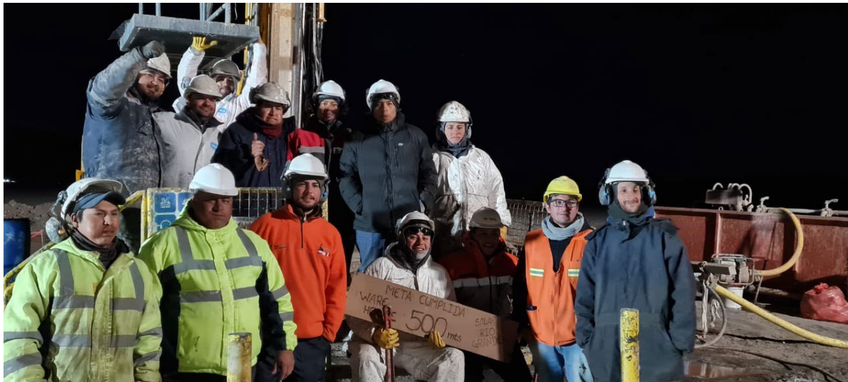
Figure 2 – Pursuit’s on-site drilling team following completion of DDH-2 to a depth of 500m

Following completion of DDH-2, Pursuit is currently awaiting environmental approvals to commence drilling at DDH-3 which is to be relocated to the Mito tenement in the north section of Rio Grande. Pursuit is targeting a material resource upgrade in 2024, which will build on the recent maiden resource defined at the Rio Grande Sur Project. 1 The adjustment of DDH-3 from the southern section to the northern section is focused on maximising this resource upgrade target, with intercepts of ~900mg/l Li obtained from an adjacent project some ~2km to the east of the proposed location of DDH-3.