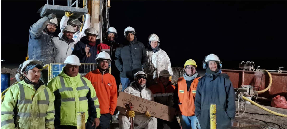
Figure 2 – Pursuit’s on-site drilling team following completion of DDH-2 to a depth of 500m

Following completion of DDH-2, Pursuit is currently awaiting environmental approvals to commence drilling at DDH-3 which is to be relocated to the Mito tenement in the north section of Rio Grande. Pursuit is targeting a material resource upgrade in 2024, which will build on the recent maiden resource defined at the Rio Grande Sur Project. 1 The adjustment of DDH-3 from the southern section to the northern section is focused on maximising this resource upgrade target, with intercepts of ~900mg/l Li obtained from an adjacent project some ~2km to the east of the proposed location of DDH-3.