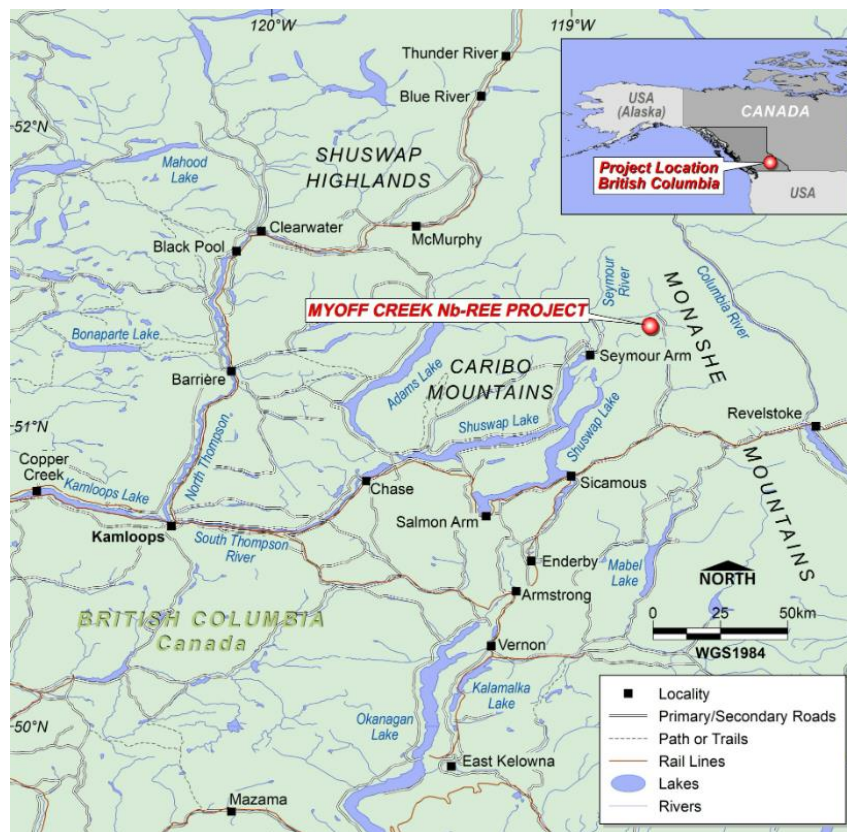
Figure 1 – Myoff Creek Project location

The Myoff Creek Nb-REE project is located in the northern Monashee Mountains of south-eastern BC, Canada.