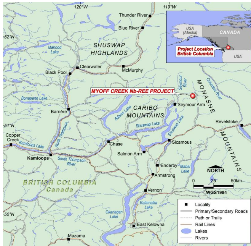
Figure 1 – Myoff Creek Project location

The Myoff Creek Nb-REE project is located in the northern Monashee Mountains of south-eastern BC, Canada.