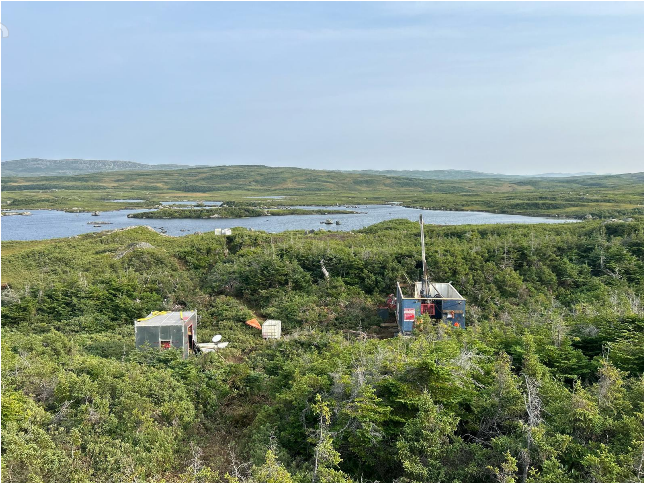
FIGURE 2: DIAMOND DRILLING AT O-2 WEST TARGET