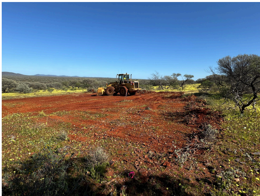
Figure 01: Earthworks commencing at the Remorse Target

TEM have previously announced its plans to conduct a circa 5,000m Reverse Circulation (RC) drilling program at the exciting Copper focussed Remorse Target 1 which is part of the Company's flagship Yalgoo Project. Works have been significantly delayed due to unforeseen weather and flooding onsite 2 which have prevented safe access. Earthworks have now commenced including site access tracks and drill pad construction. Upon completion of this work, drilling is anticipated to start late August 2024.