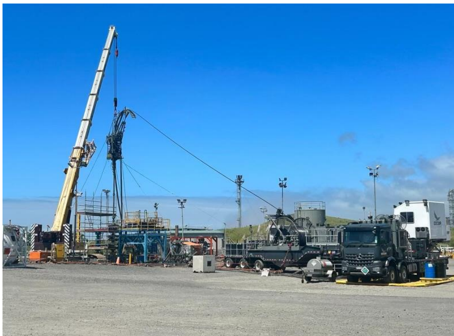
The CTU operated by Condor Energy (on a previous well location)

The on-site operations for the Daydream-2 stimulation and testing program have now recommenced with Elixir’s contracting staff returning to the well-site to prepare for the arrival of the coil tubing unit (CTU). This unit was recently imported from New Zealand to undertake work for the Company and its neighbouring Operator.