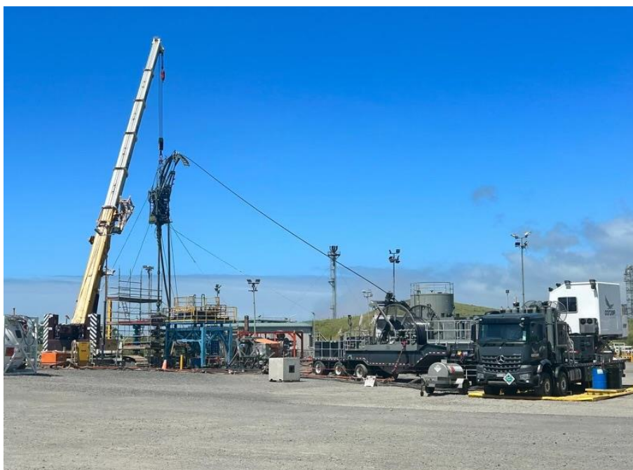
The CTU operated by Condor Energy (on a previous well location)

The on-site operations for the Daydream-2 stimulation and testing program have now recommenced with Elixir’s contracting staff returning to the well-site to prepare for the arrival of the coil tubing unit (CTU). This unit was recently imported from New Zealand to undertake work for the Company and its neighbouring Operator.