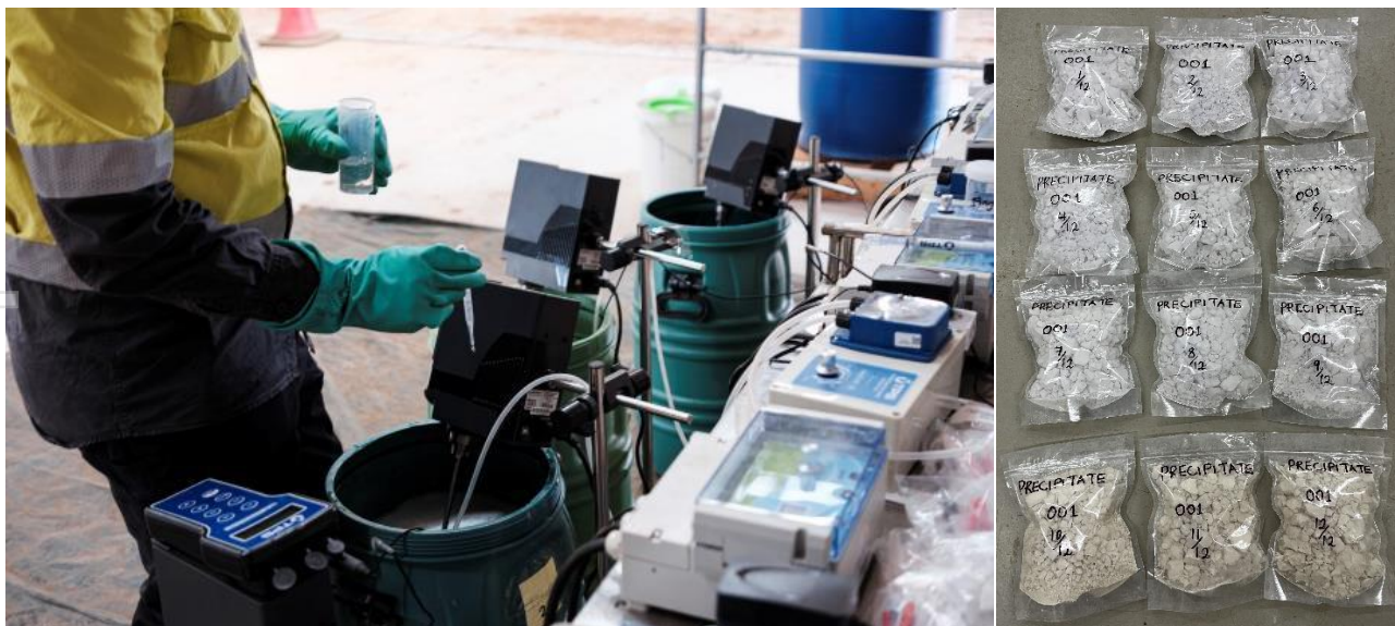
Figure 2: Demonstration plant precipitation circuit and inventory of MREC samples being dispatched to Australia for analysis.

During the quarter, the RRM team continued demonstration plant activity to scale up production of MREC in Uganda to satisfy requirements to progress several offtake negotiations underway for Makuutu's magnet and heavy rare earth rich basket. Production activities ramped up over the June quarter and the first shipment of samples is expected to leave Uganda shortly for Australia for analysis and dispatch to potential offtake parties.