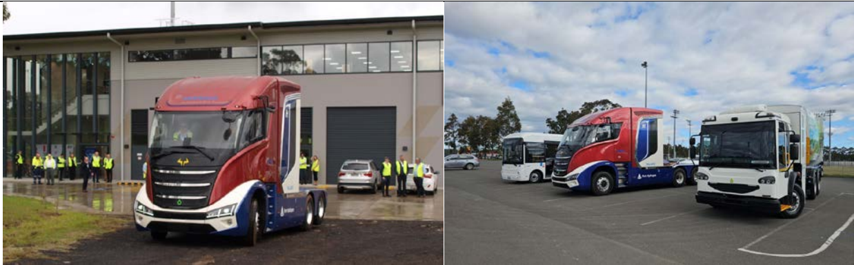
Image 4 and 5: Drive Day at Sydney Motorsport Park on 8 May 2024 and Blacktown International Sports Park on 17 July 2024, respectively