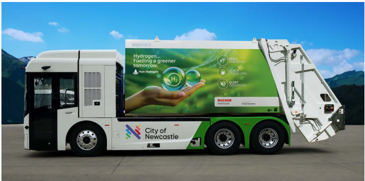
Image 1: Hydrogen Fuel Cell Garbage Truck similar to the one that City of Newcastle has ordered

During the quarter, Pure executed a Term Sheet with the City of Newcastle to supply a rear-loading HFC waste collection vehicle. The Term Sheet sets out the framework for the City of Newcastle to lease the vehicle and conduct a 12-month trial with the option of a four-year extension.