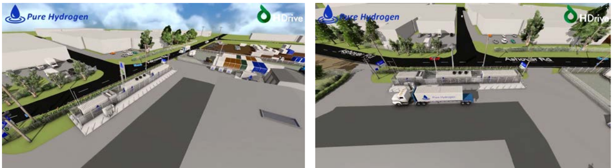
Image 2 and 3: Pure Hydrogen's first micro-hub refuelling site at Archerfield Airport – elevated view and view on to Ashover Road respectively

Planning works have commenced for the Archerfield micro-hub to be developed in stages. Stage 1 is based on initially utilising 1,000m 2 of the site with an anticipated output of 420kg of green hydrogen fuel per day. Scale-up will occur in future stages based on growing demand, serving selected target markets in commercial transport and the aviation industry.