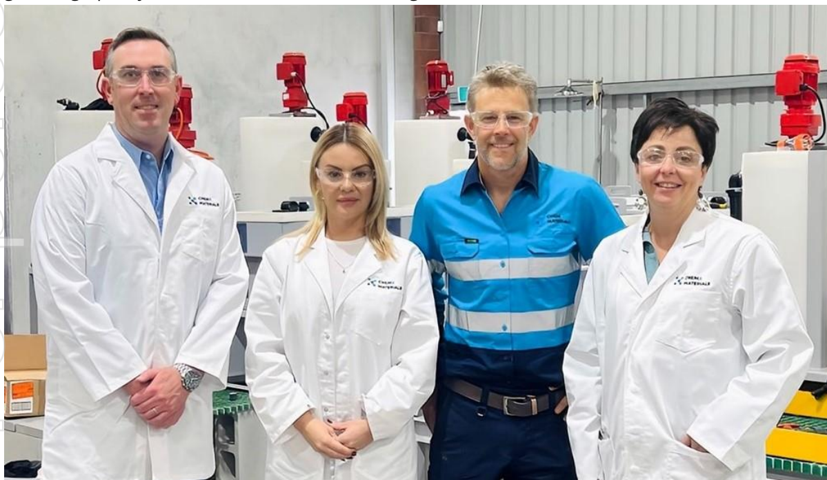
Figure 3 – Pictured Left to Right:

Discussions are ongoing with regard to eligible government grants and industry support opportunities given high purity alumina’s critical mineral listing status.