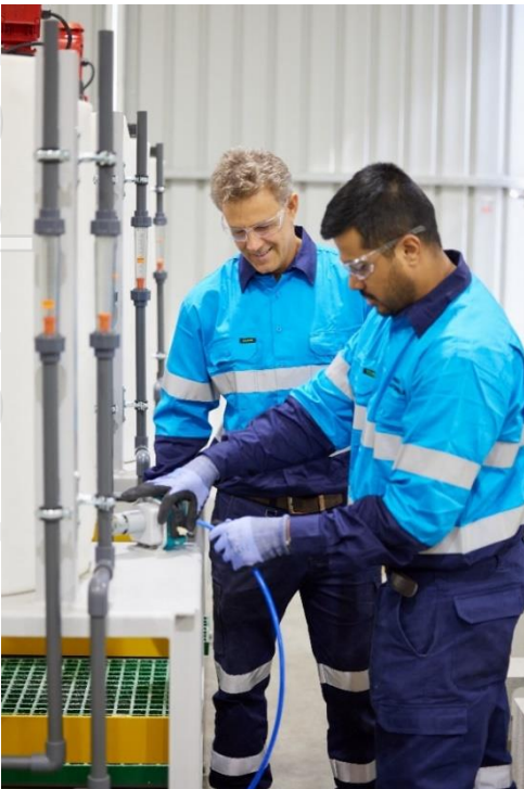
Figure 2 - ChemX Team actively plumbing key reagent delivery systems to the unique HiPurA® SX Circuit

Next stage construction work is heavily focused on the innovative HiPurA® Solvent Extraction (SX) Circuit.