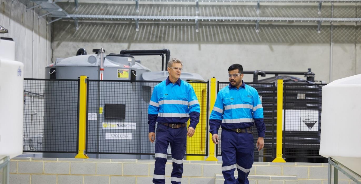
Figure 1 - ChemX Team pictured in front of the reagents compound.

Reagent systems are also nearing operational readiness stage, pictured below.