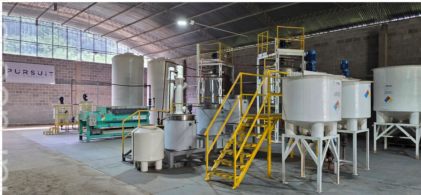
Figure 6: 250tpa Lithium Carbonate Plant at Pursuit's purpose facility in Salta, Argentina

The Pilot Plant allows for the testing of the circuit chemistry in a real time environment seeking to minimise both scalability and quality control issues. The Pilot Plant will look to produce an initial sample batch using synthetic brine of approximately 50-100kg of product.