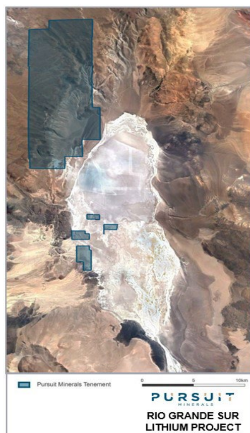
Figure 1: Rio Grande Sur Tenement Map