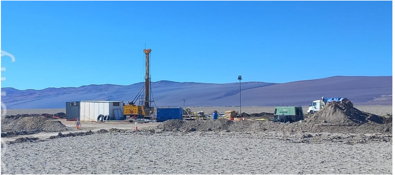
Figure 4 - Drilling at DDH-2 at the Sal Rio O2 Tenement

Drilling progress at DDH-2 has continued with the hole set for completion by the end of August 2024 with multiple packer samples already taken from shallower depths.