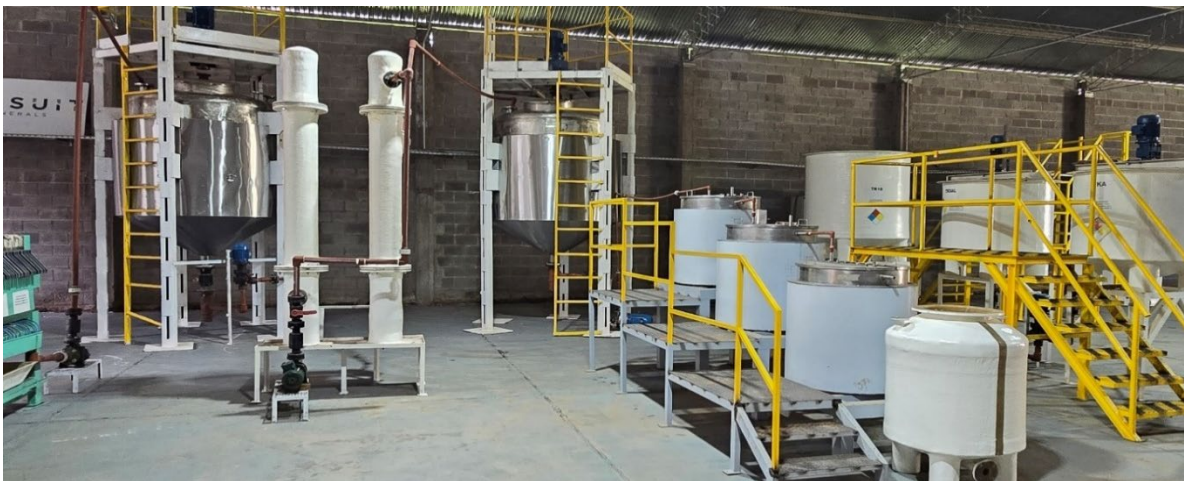
Figure 5: 250tpa Lithium Carbonate Plant at Pursuit's purpose facility in Salta, Argentina

During the quarter, the Company continued the start up works of the Lithium Carbonate Pilot Plant following its commissioning working toward first production of Lithium Carbonate of both battery and technical grade.