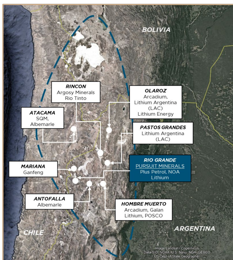
Figure 2: RGS Project location in the ‘Lithium Triangle’ Region