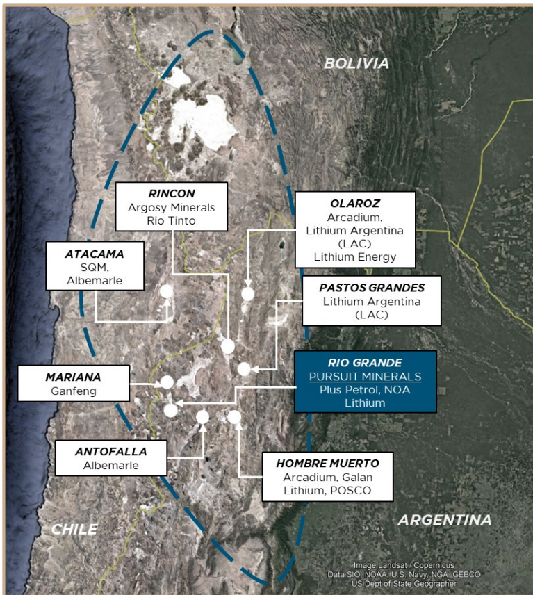
Figure 2: RGS Project location in the ‘Lithium Triangle’ Region