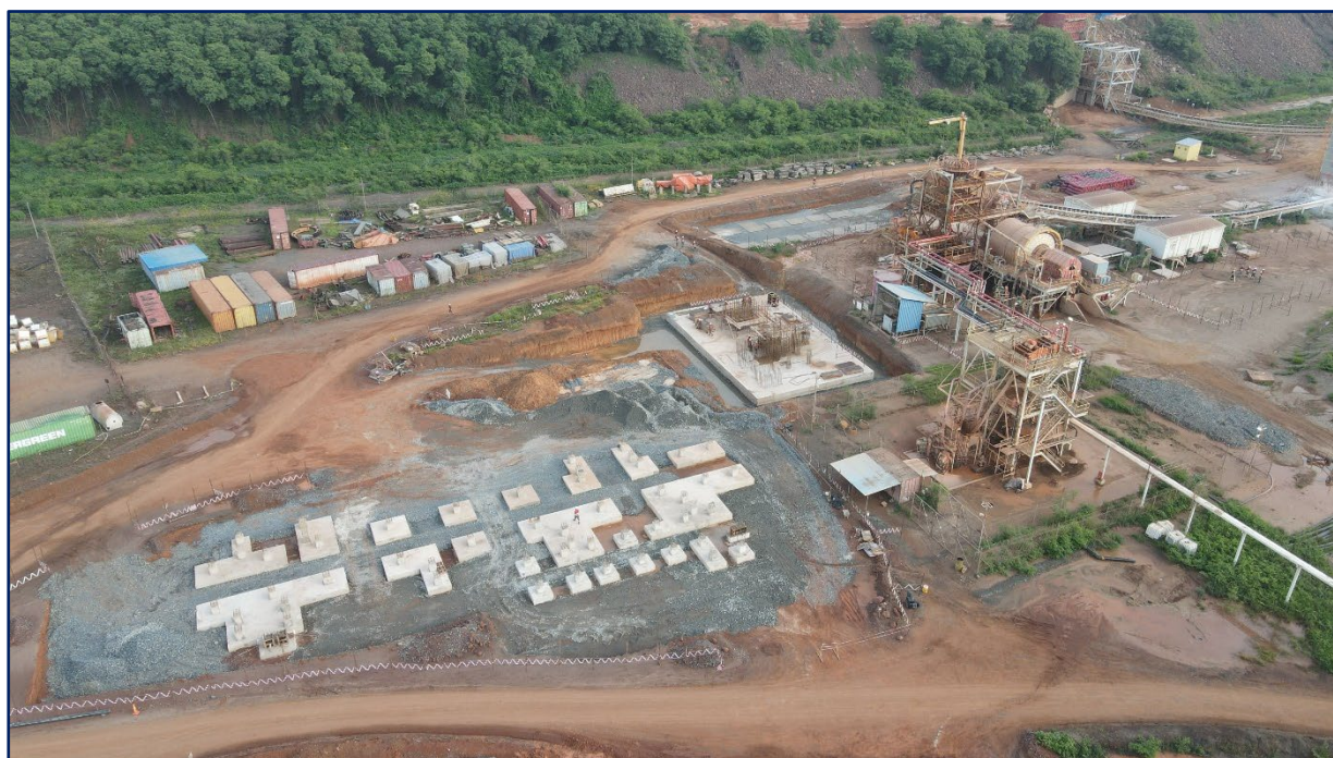
Figure 1: Ball mill and flotation area foundations

The photos below, from 17 th July, show progress on the SSCP.