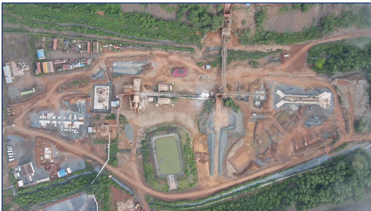
Figure 2: Aerial view of the SSCP construction area