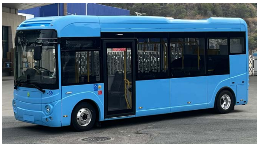
Picture of HFC Mini Bus

In accordance with the MOU, the VAHC has expressed interest in up to three hydrogen fuel cell (HFC) minibuses, and two HFC Coaches, to be supplied by Pure Hydrogen and manufactured by Pure Hydrogen subsidiary Hdrive International.