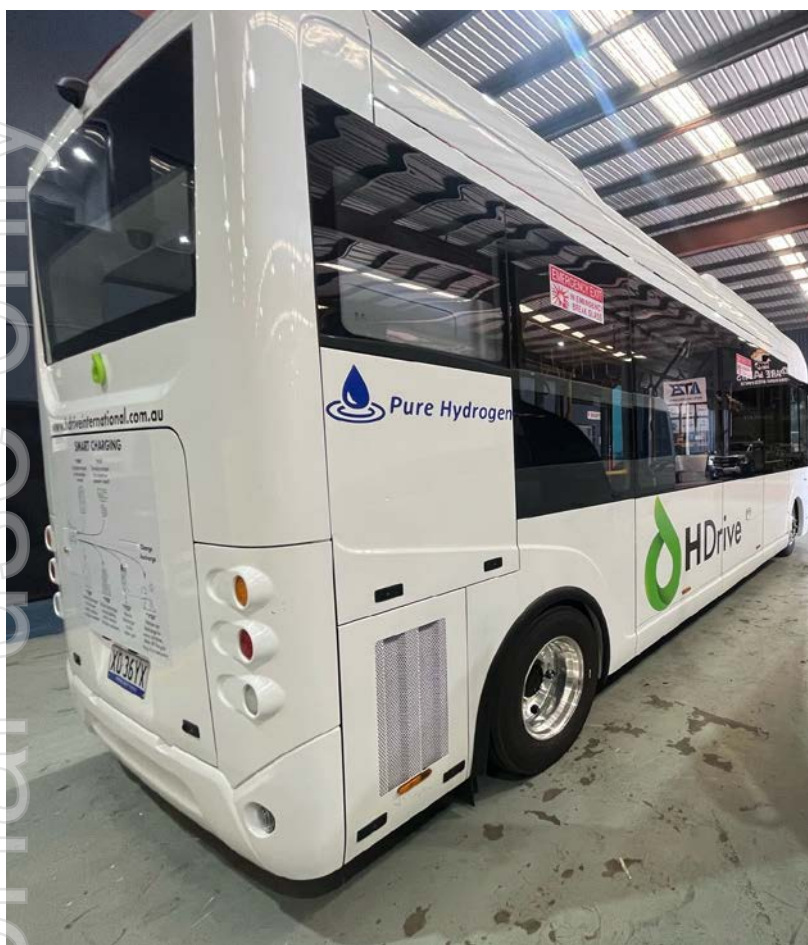
Picture of a Hdrive Bus