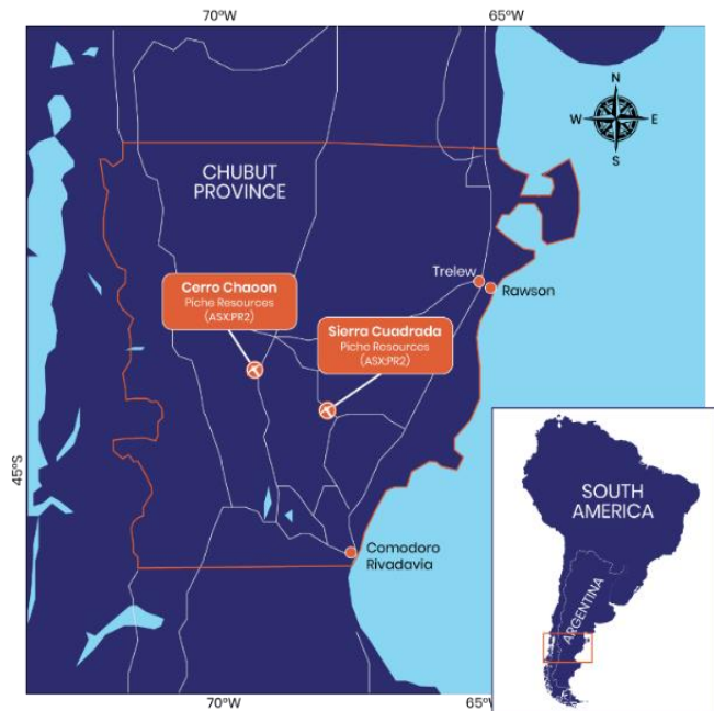
Figure 2: Argentinian projects map