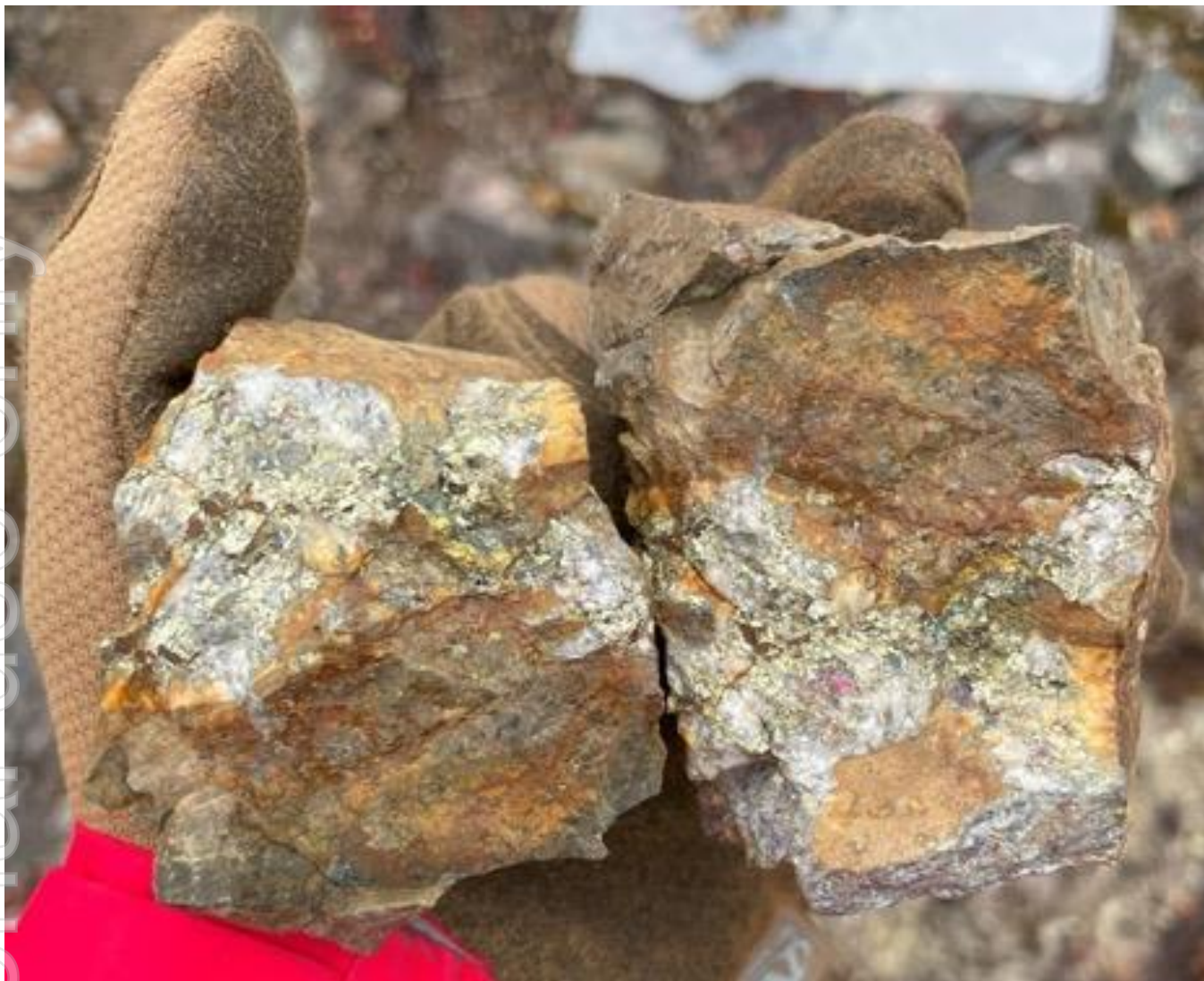
Figure 11 – Observed quartz-chalcopyrite vein with minor bornite from the Glacier epithermal trend which has been sampled over 200m strike length.