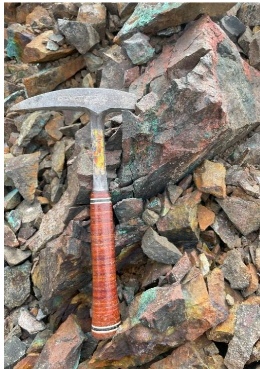
Figure 9 - Example of visually observed bornite-chalcopyrite cemented breccia (left) and strong brick red potassic alteration with observed chalcopyrite-malachite veining from the western extent of the Glacier IOCG target.