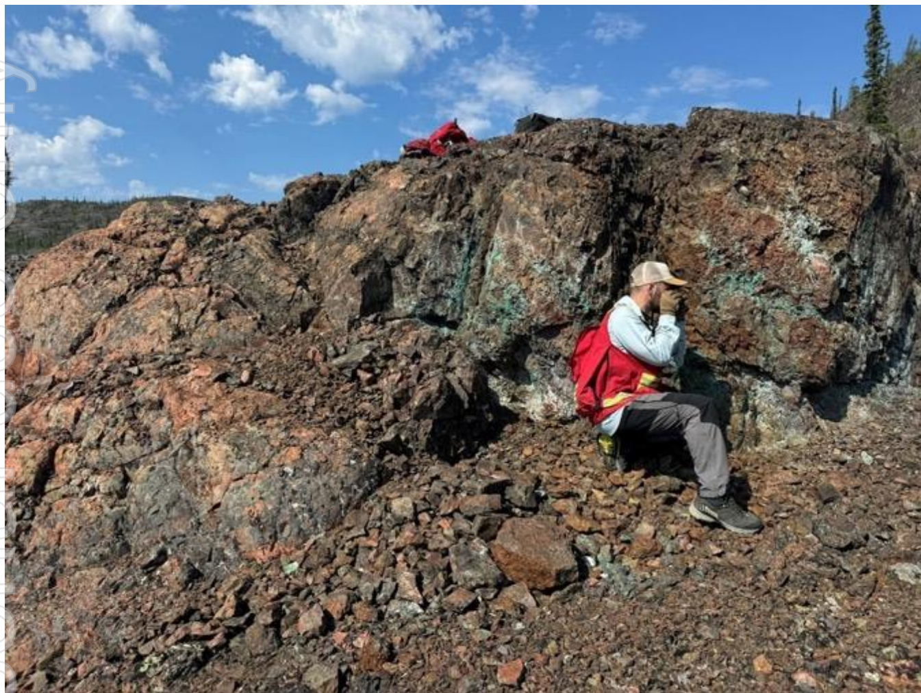
Figure 1 - Outcrop of the Mile Lake Skarn Breccia displaying widespread secondary copper mineralisation throughout the 10-15m thick skarn-breccia interval

11 rock chip samples were collected on a semi-regular grid across the mineralisation with a surface footprint of 55 m NW/SE and apparent thickness of 10-15m.