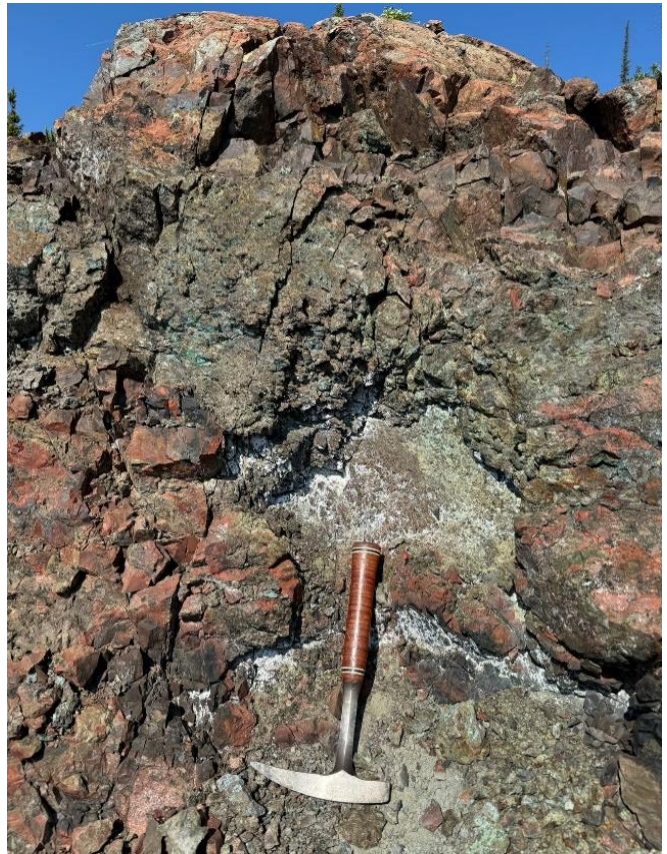
Figure 2 - Sample locations of F005406 (left) and F005409 (right) at the Mile Lake Skarn Breccia.