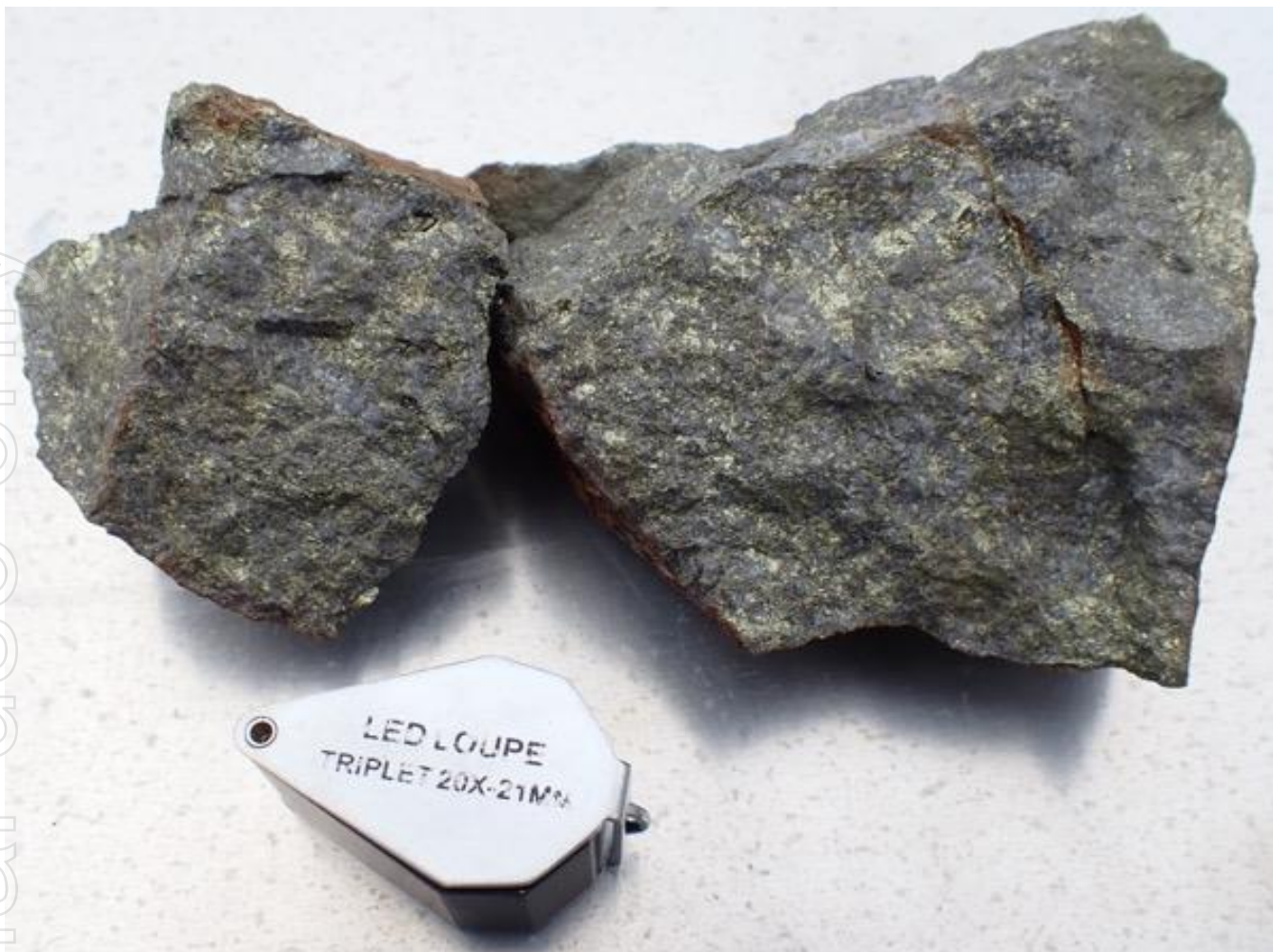
Figure 12 - Example of the Sparkplug Lake quartz-chalcopyrite veining which occurs within a 430 x 160m zone.