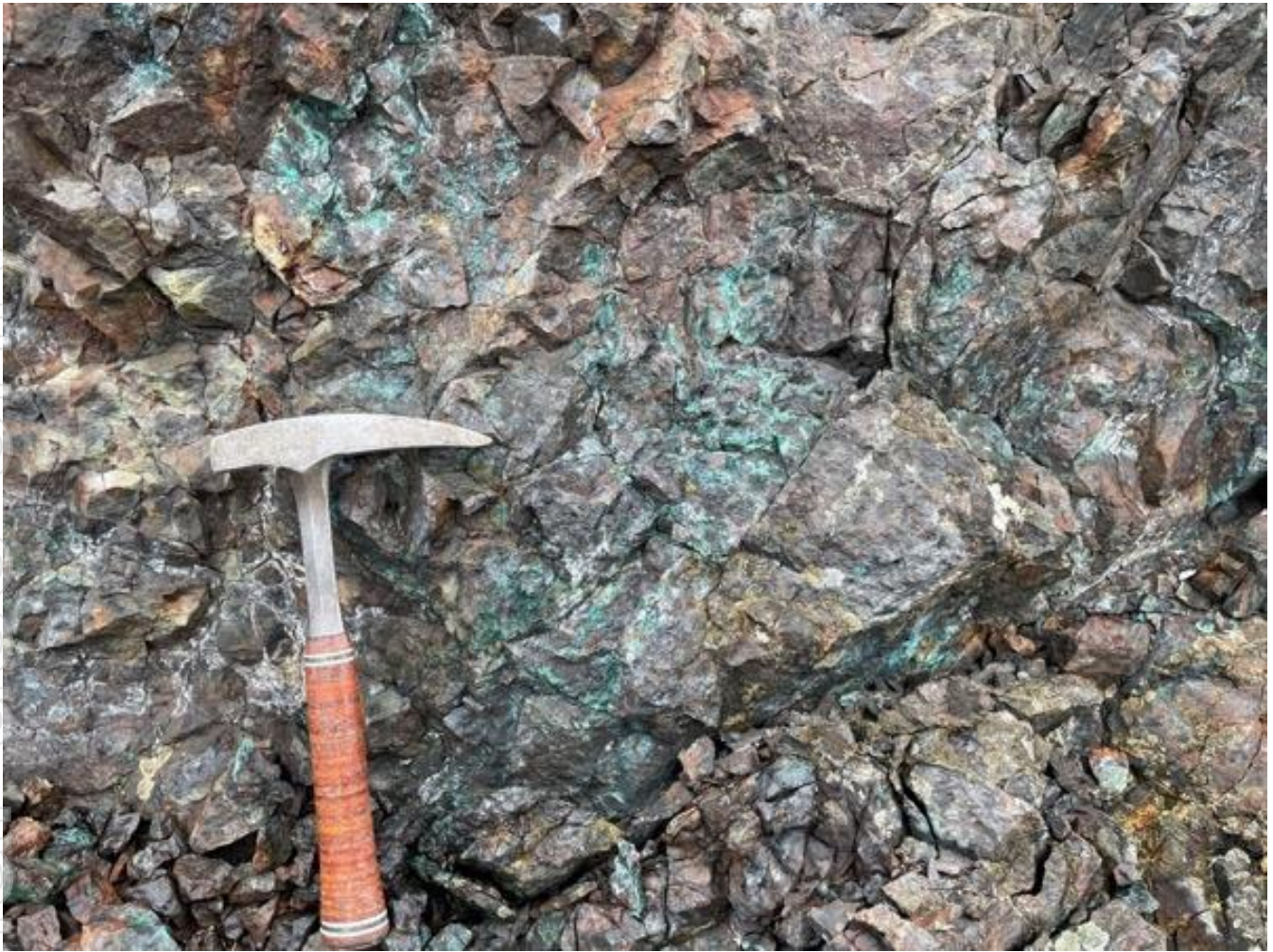
Figure 10 - Example of visually observed malachite staining of the potassic altered andesites at the eastern extent of the Glacier trend. Photograph shows a part of the 10m thick mineralised outcrop which is continuous on surface for 60m.