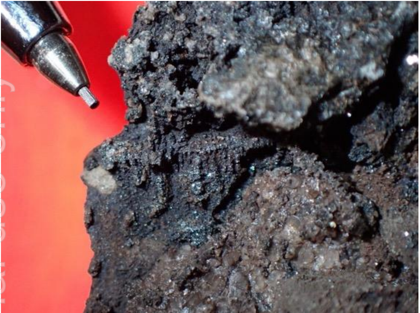
Figure 6 - Example of herringbone texture in possible native silver bearing sample taken 530 m NW of the historic Bonanza Silver Mine. Associated with calcite-fluorite veining and chlorite alteration.