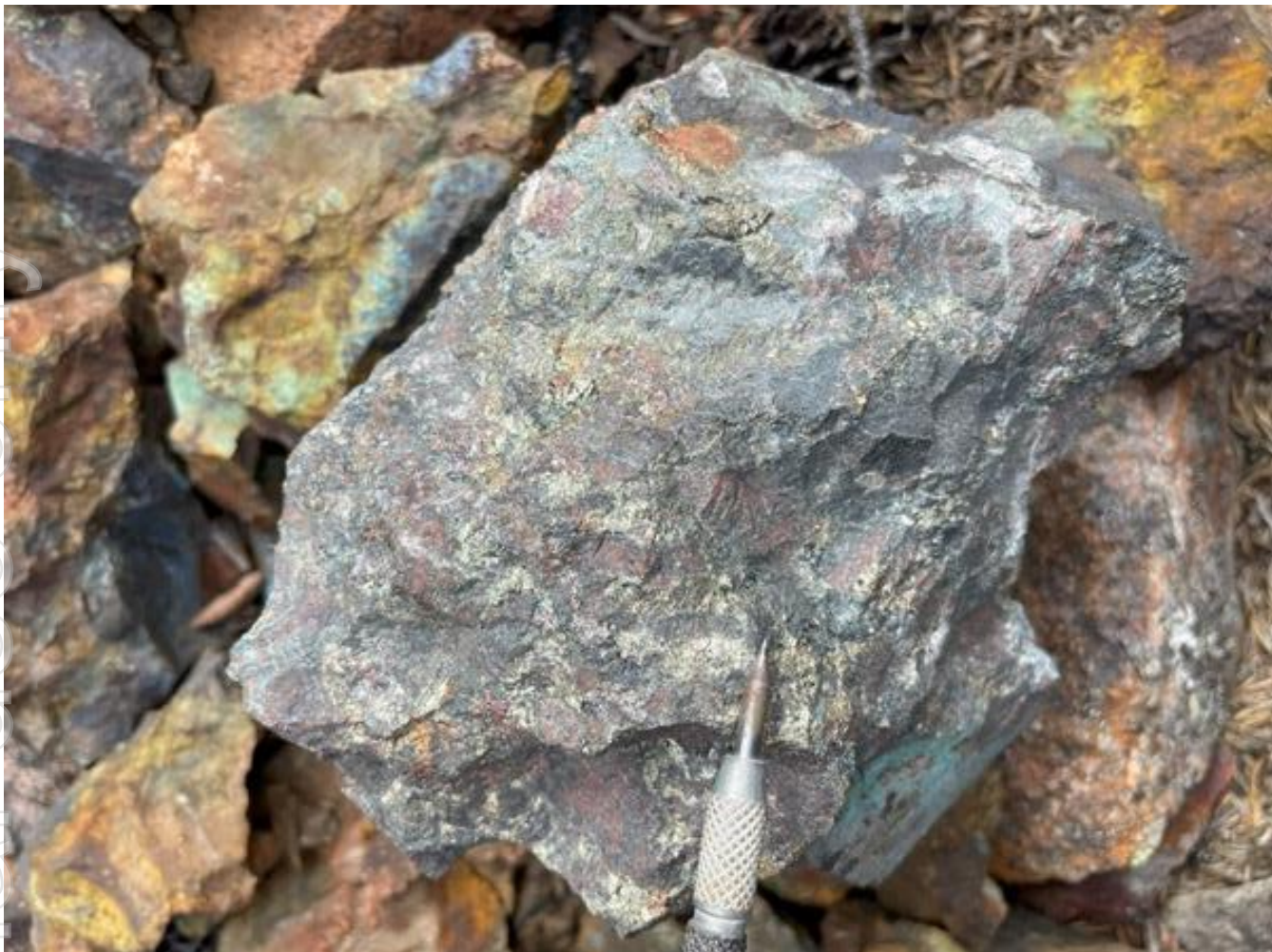
Figure 8 - Example of visually observed chalcopyrite cemented breccia from the western extent of the Glacier IOCG target. Clasts are composed of brick-red k-feldspar altered andesite.