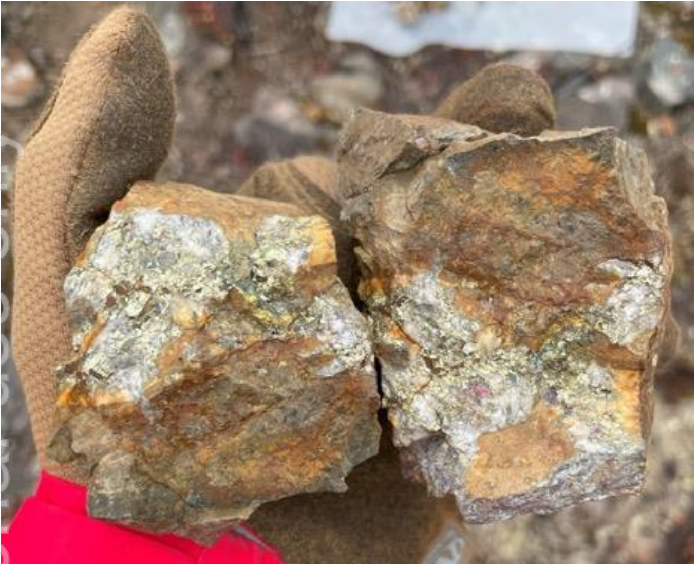
Figure 11 – Observed quartz-chalcopyrite vein with minor bornite from the Glacier epithermal trend which has been sampled over 200m strike length.