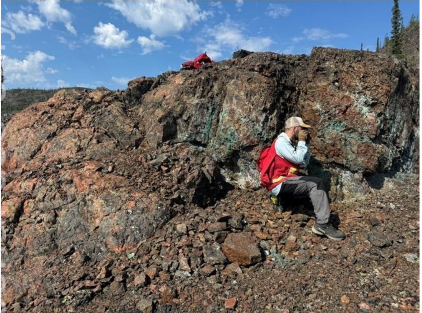
Figure 1 - Outcrop of the Mile Lake Skarn Breccia displaying widespread secondary copper mineralisation throughout the 10-15m thick skarn-breccia interval

11 rock chip samples were collected on a semi-regular grid across the mineralisation with a surface footprint of 55 m NW/SE and apparent thickness of 10-15m.