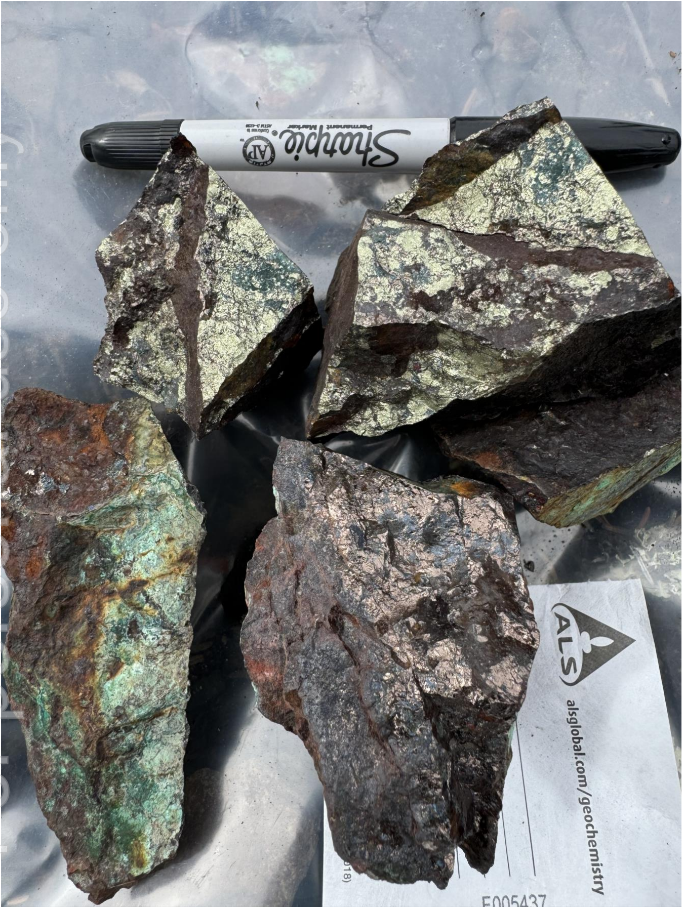
Figure 7 – Rock sample F005437 from a mineralised outcrop of massive chalcopyrite-bornite at the Glacier Target.