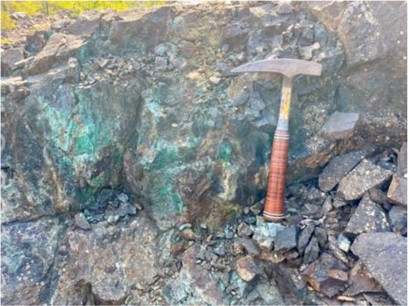
Figure 3 - Outcropping mineralisation at the Thompson prospect.