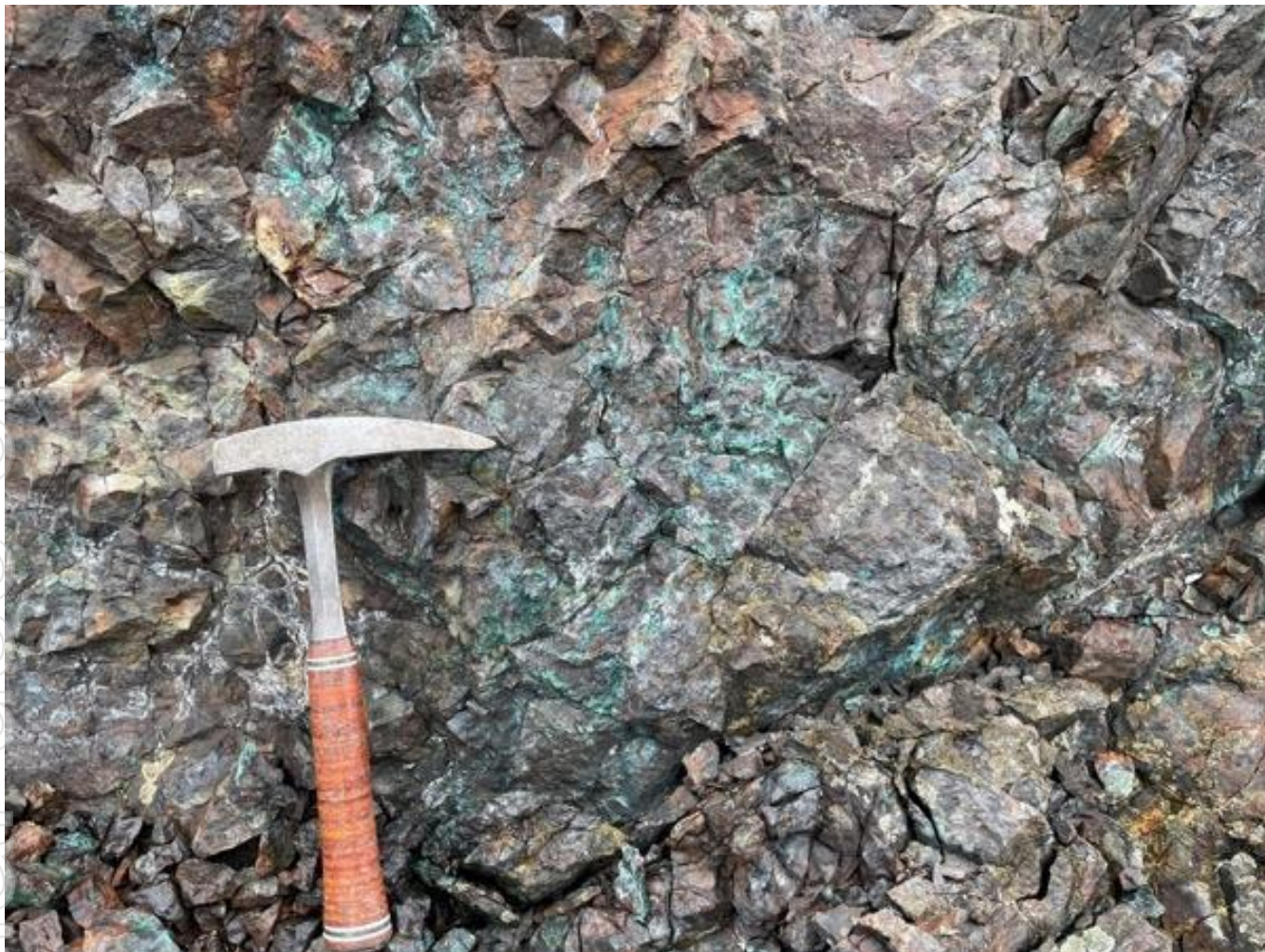
Figure 10 - Example of visually observed malachite staining of the potassic altered andesites at the eastern extent of the Glacier trend. Photograph shows a part of the 10m thick mineralised outcrop which is continuous on surface for 60m.