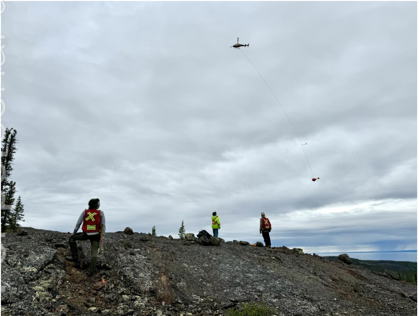
Figure 0 - Heli mounted MobileMT aerial surveys and field works underway at Great Bear Lake