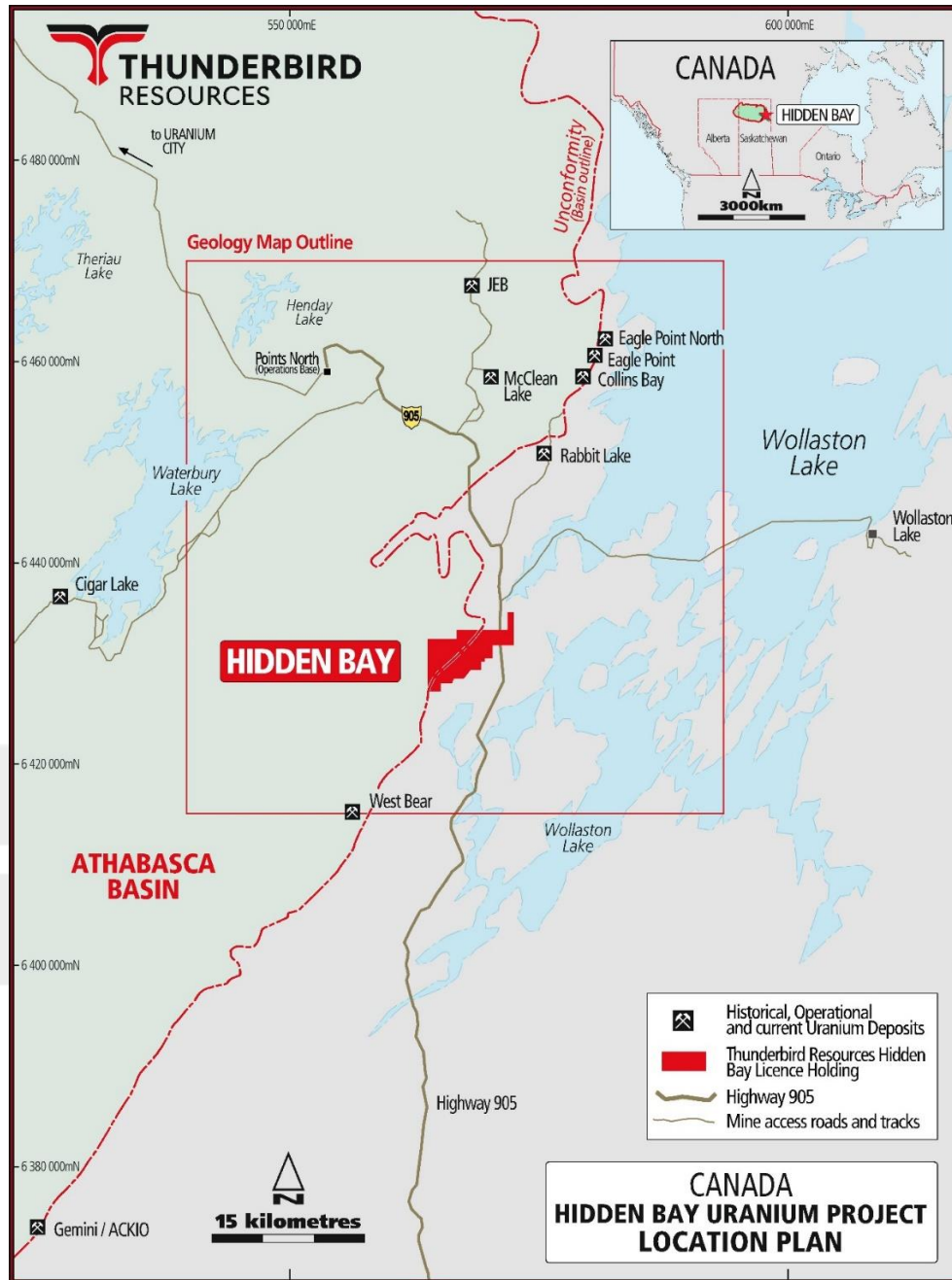
Figure 1. Location of Hidden Bay Uranium Project in the Athabasca Basin

Hidden Bay is located approximately 20km south of the historic Rabbit Lake Uranium mine, which was the longest running uranium mine in North America with over 41 years of mining, producing over 203 million pounds of uranium concentrate 1 . This part of the Athabasca Basin is highly endowed with several uranium deposits and producing mines within a 40km radius including Eagle Point, Collins Bay, Cigar Lake, Roughrider, and Horseshoe-Raven (see Figures 1 and 2). Despite its proximity to multiple uranium prospects and deposits only one hole has been drilled on the property in the last 35 years (see Figure 3).