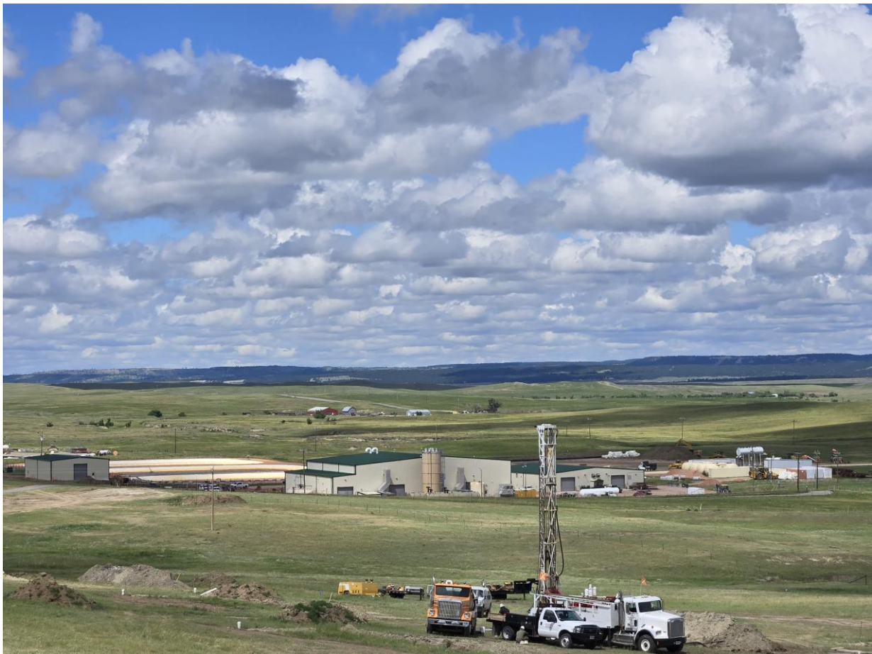
Figure 3: Active well installation at Mine Unit 3. Ross Plant in background.

The surface facilities for HH-11 which include the header house building, well plumbing and electrical connections, and meter runs are approximately 55% complete. HH-11 is on schedule to commence pre-conditioning operations in 3Q2024.