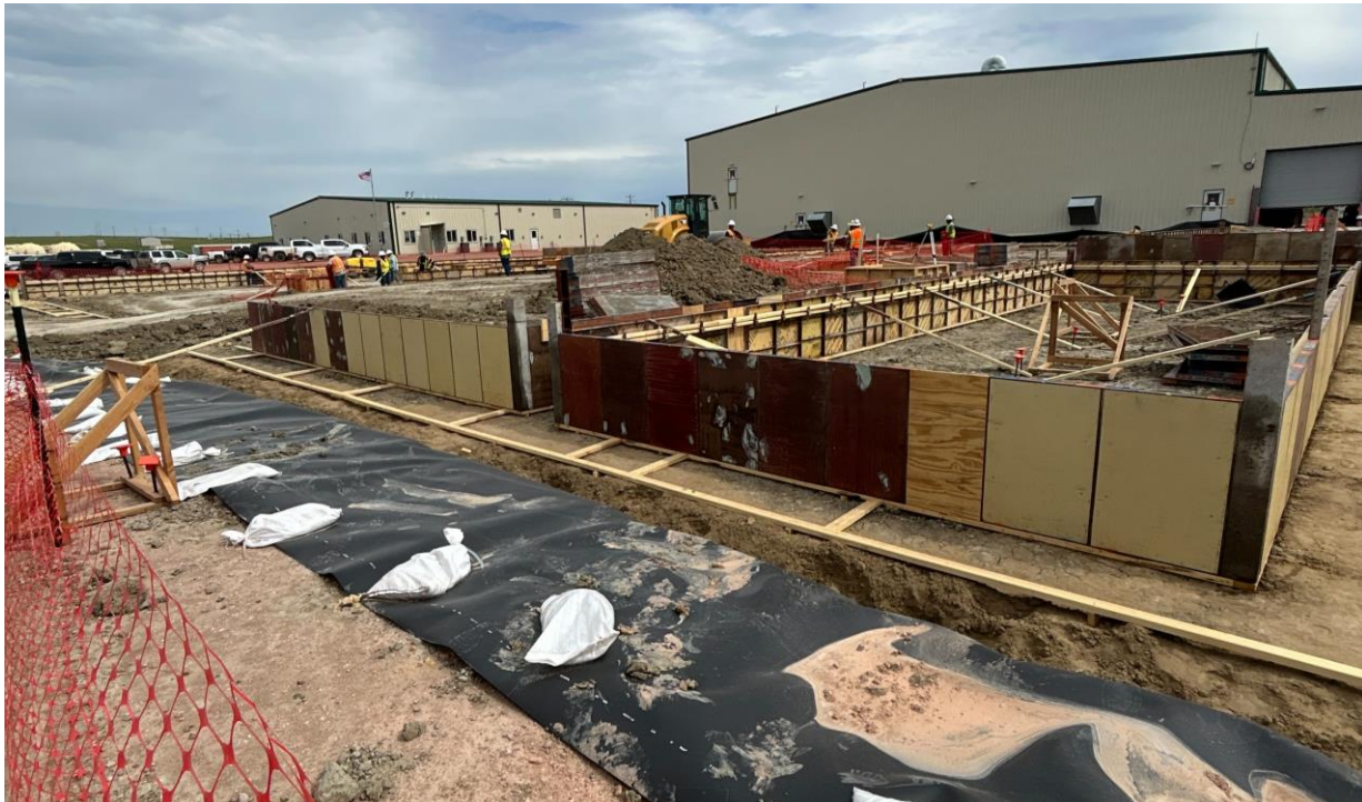
Figure 2: Crews installing forms in preparation for upcoming concrete pours at Ross CPP site