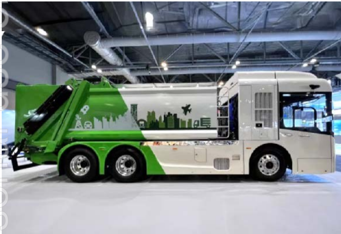
Picture of Hydrogen Fuel Cell Garbage Truck similar to the one that City of Newcastle has ordered

"We're committed to delivering a 100 per cent reduction in carbon emissions from City of Newcastle vehicles during the next decade and we'll continue driving toward this goal by trialling new technologies that contribute to this transition."