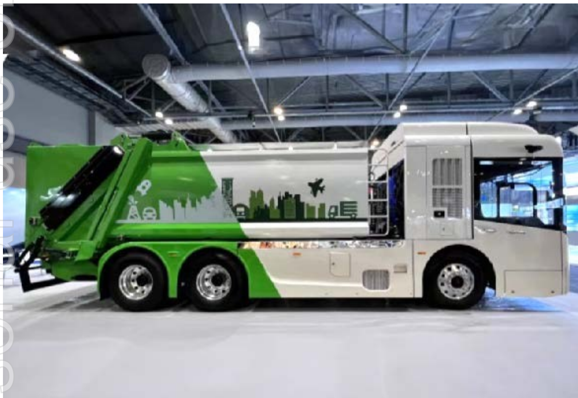
Picture of Hydrogen Fuel Cell Garbage Truck similar to the one that City of Newcastle has ordered

"We're committed to delivering a 100 per cent reduction in carbon emissions from City of Newcastle vehicles during the next decade and we'll continue driving toward this goal by trialling new technologies that contribute to this transition."