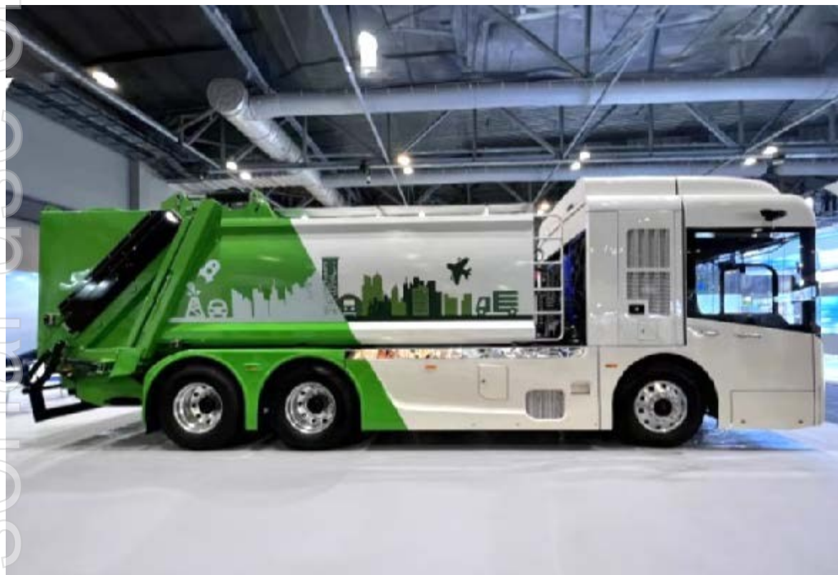
Picture of Hydrogen Fuel Cell Garbage Truck similar to the one that City of Newcastle has ordered

"We're committed to delivering a 100 per cent reduction in carbon emissions from City of Newcastle vehicles during the next decade and we'll continue driving toward this goal by trialling new technologies that contribute to this transition."