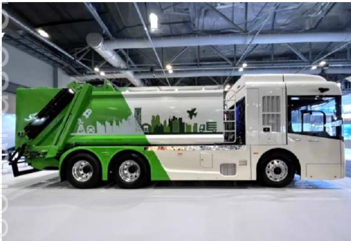
Picture of Hydrogen Fuel Cell Garbage Truck similar to the one that City of Newcastle has ordered

"We're committed to delivering a 100 per cent reduction in carbon emissions from City of Newcastle vehicles during the next decade and we'll continue driving toward this goal by trialling new technologies that contribute to this transition."