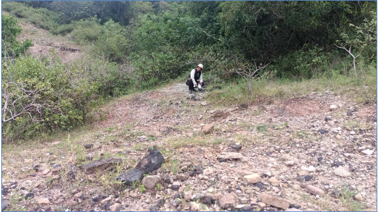
Figure 2: Location of sample CBR114506 showing manganese formation just below the surface in Reconnaissance Permit ESR-RP-01, 7km along strike from the Lalena Prospect; greater than 80% of the sample was logged as manganese and iron oxides.

The exploration team is currently compiling the recent mapping within the Concession areas which will form the basis of a technical report to be submitted to the Timor-Leste regulatory body, the Autoridade Nacional dos Minerais (ANM).