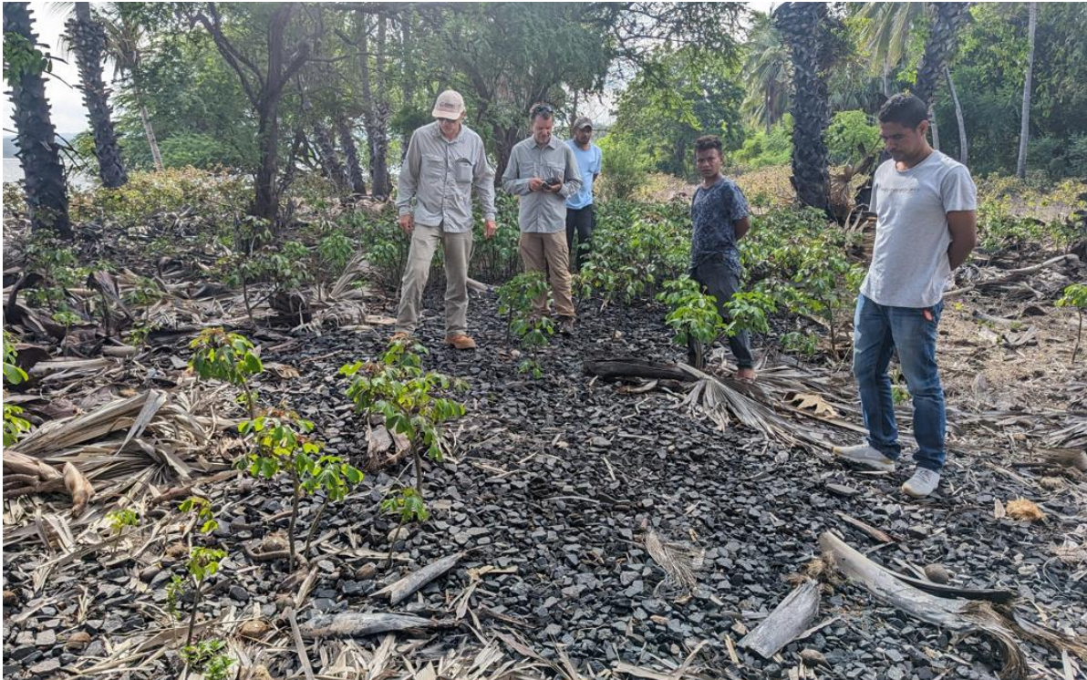
Figure 3: Manganese stockpile from Japanese WW2 port location where previously announced manganese and iron oxide grab samples assayed 57.1% Mn and 58.1% Mn from ALS.

The Board has authorised for this announcement to be released to the ASX.