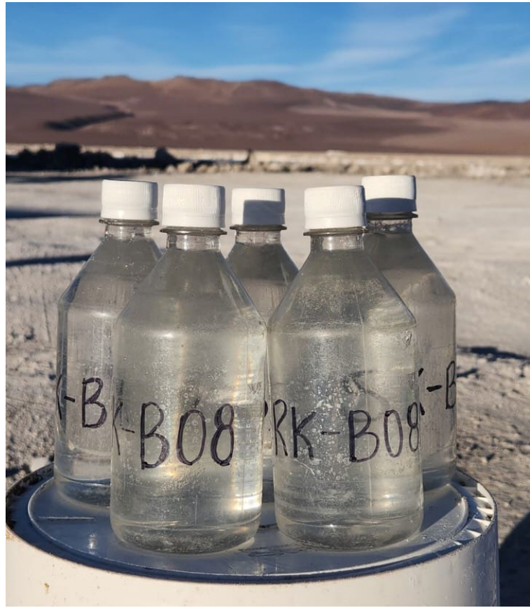
Figure 4 – Lithium Brine Samples collected from DDH-1 at the Rio Grande Sur Project.