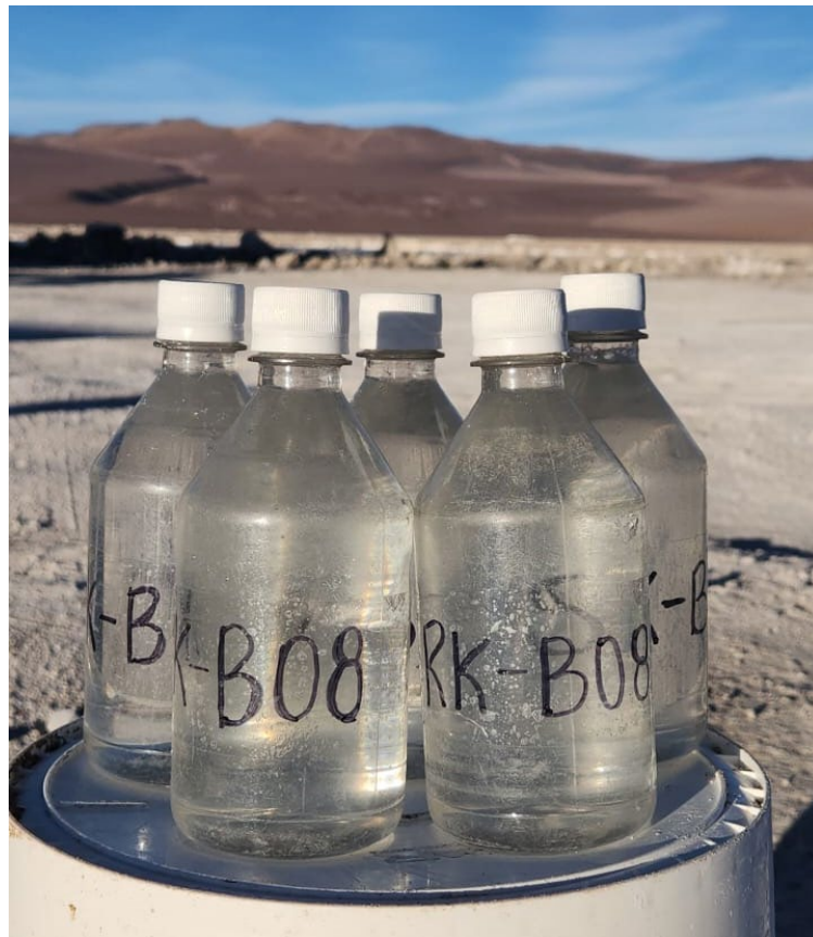
Figure 4 – Lithium Brine Samples collected from DDH-1 at the Rio Grande Sur Project.