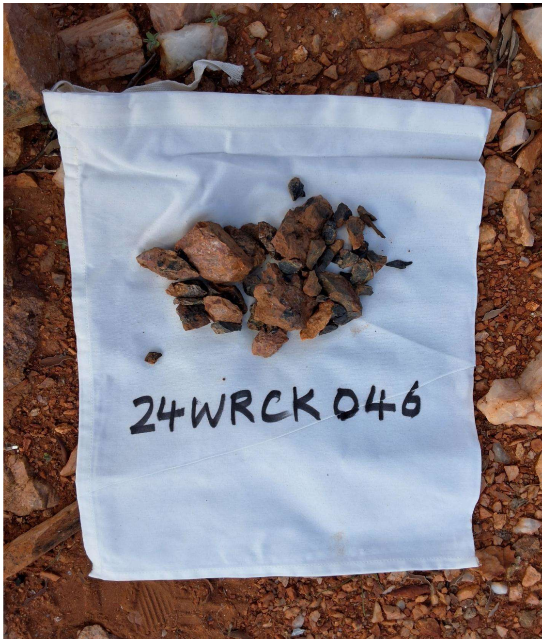
Figure 1: Large black rock fragments chipped directly from the in-situ granitic pegmatite outcrop, Wabli Creek, Gascoyne, W.A (Sample – 24WRCK046).

Most importantly, these latest high-grade assay results (17.65% Nb 2 O 5 and 13.22% Nb 2 O 5 ) confirm that the hard rock source material holds the same or similar high-grade concentrations as the weathered surface material (eluvial material) , previously reported by the Company (32% Nb 2 O 5 and 2.57% TREO - ASX Announcement 21 December 2023). Further, the in-situ samples have been chipped straight off the bedrock (in-situ) approximately 0.5km from the previously reported sample returning 32% Nb 2 O 5 .