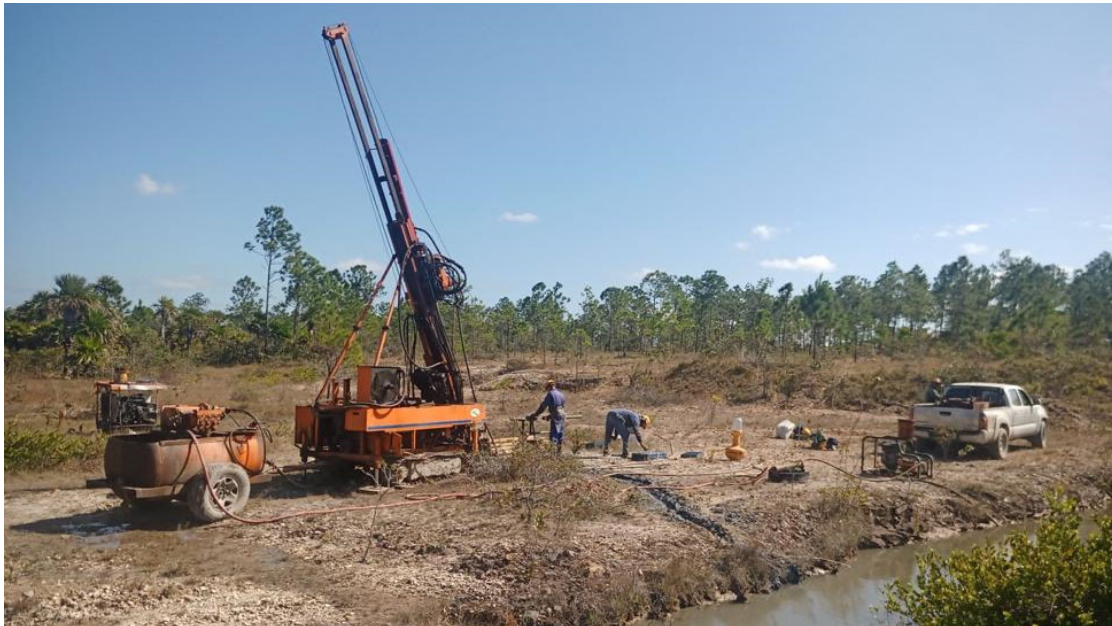
Drilling - El Pilar