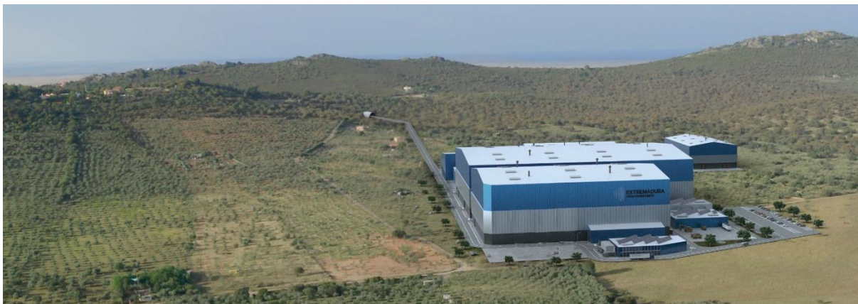
Figure 1: Design Drawing of the San José Lithium Project within the Project area and PESE.

The ECA lodgement was also facilitated by the receipt of a favourable Urban Compatibility Report from the Cáceres Local government in November 2023 (refer ASX Announcement 15 November 2023).