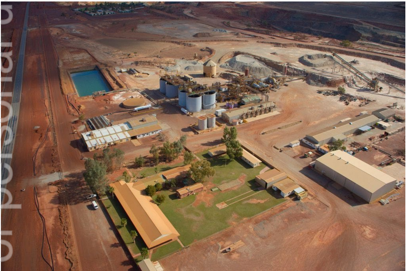
Figure 2. Westgold Bluebird Mill and Processing Facility

Bluebird has a milling capacity of circa 1.6 - 1.8Mtpa on hard ore and can process circa 2.2Mtpa on a blend of hard and soft ore.