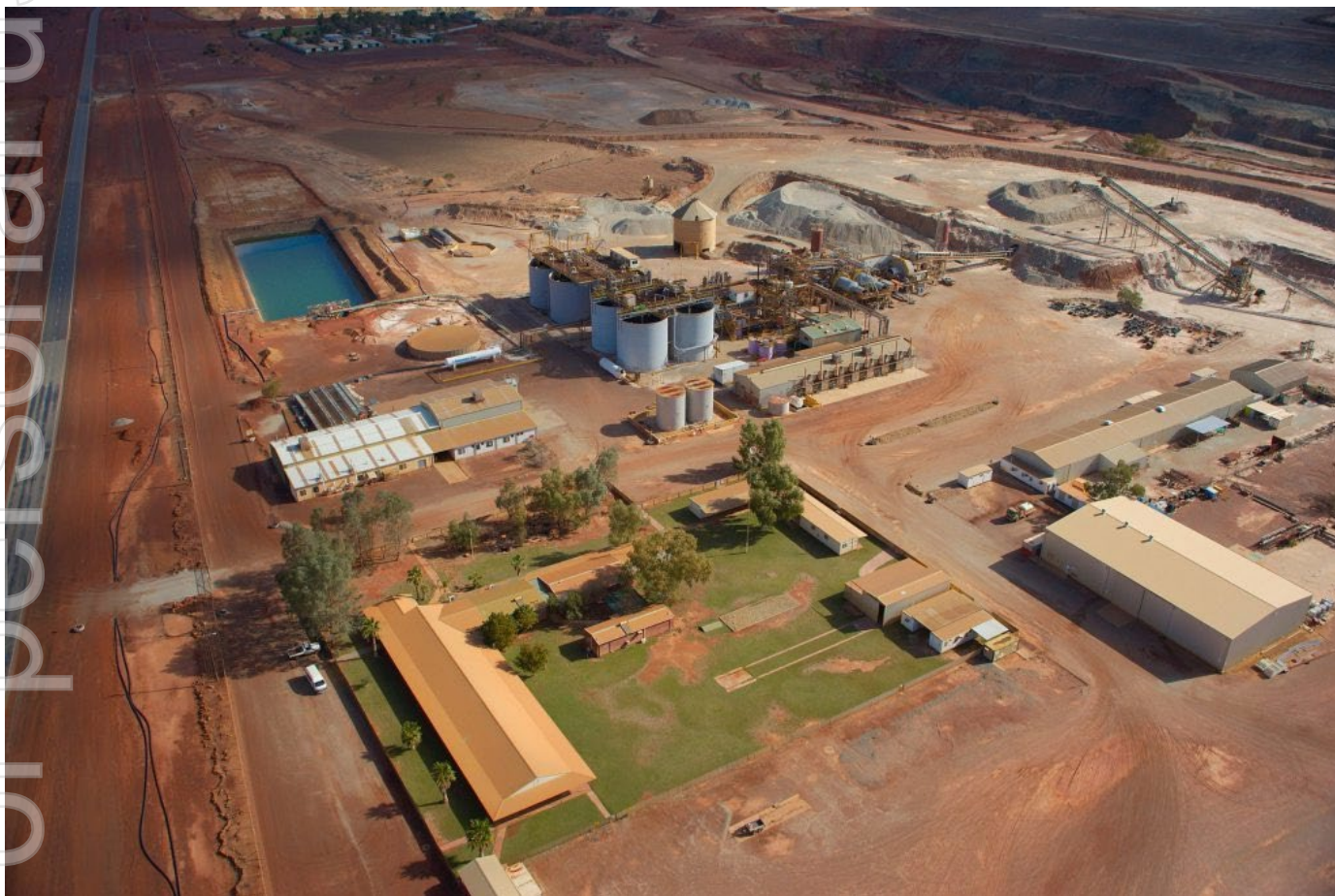
Figure 2. Westgold Bluebird Mill and Processing Facility

Bluebird has a milling capacity of circa 1.6 - 1.8Mtpa on hard ore and can process circa 2.2Mtpa on a blend of hard and soft ore.