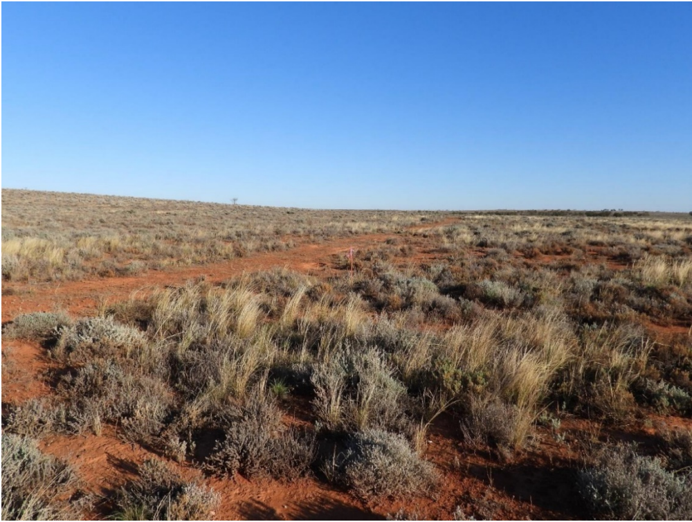
East Borehole Drill Site EB1