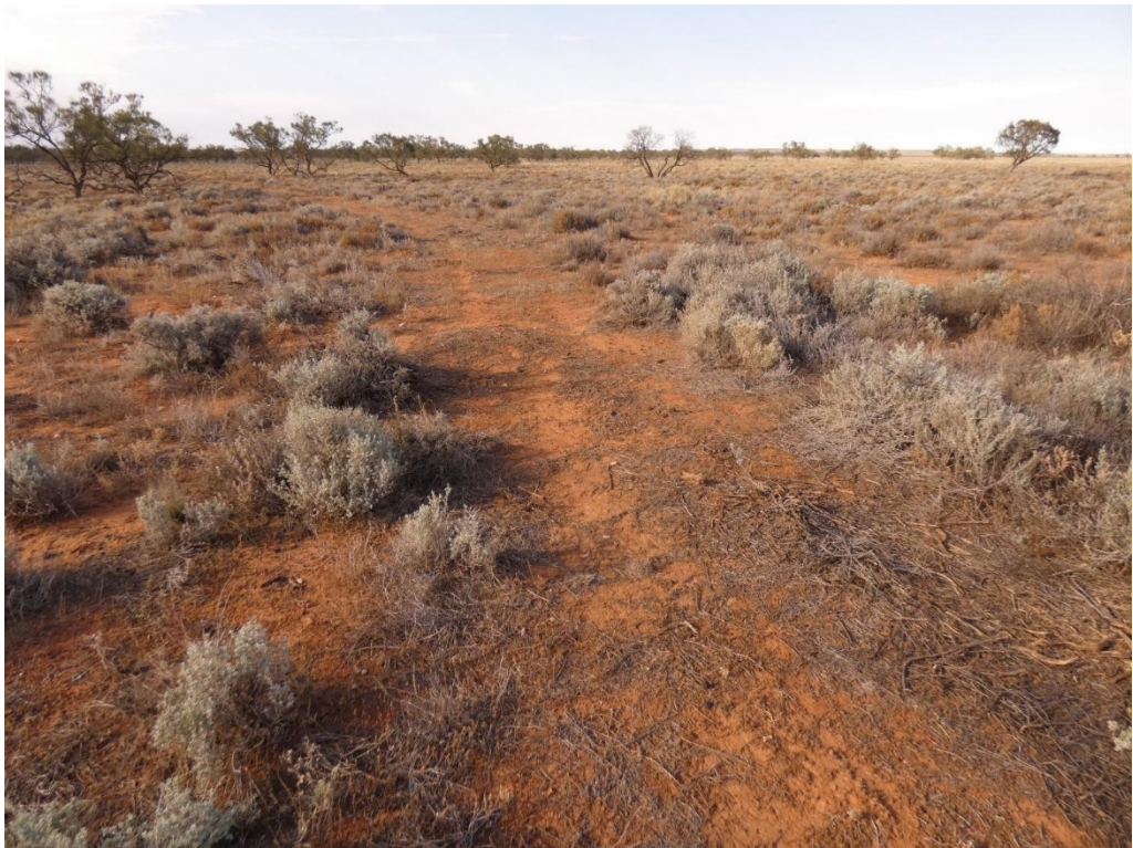
East Borehole Drill Site EB2