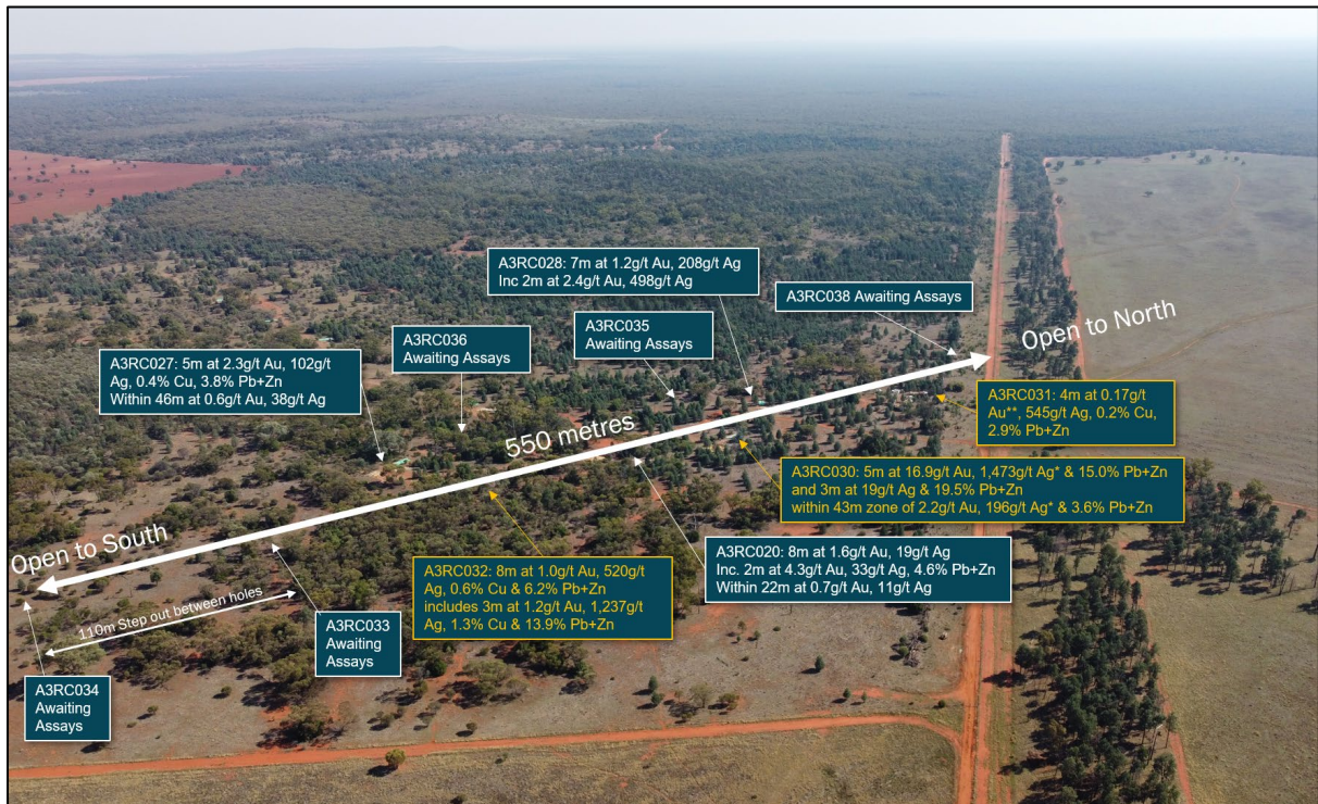
Figure 4: Annotated drone photo of Achilles looking northwest.