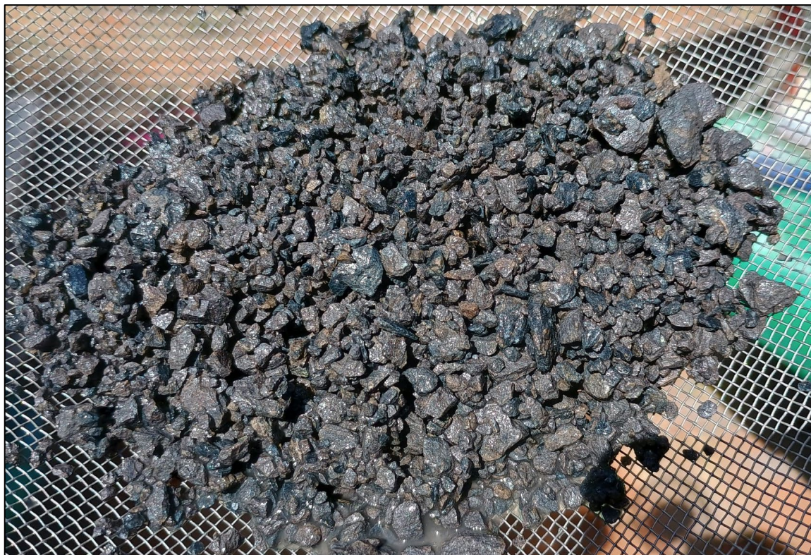
Figure 1: A3RC030 photo of massive sulphide from 115-116m, comprising the zinc mineral sphalerite (brown) and lead mineral galena (grey). This exceptionally high-grade interval yielded 13.8g/t gold, at least 3,000g/t silver, 11.4% lead and 27.4% zinc.