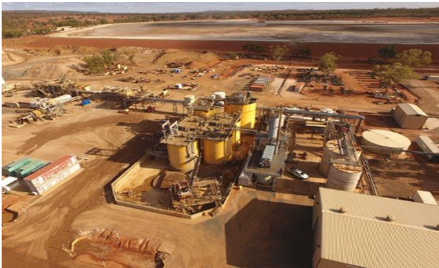
Wonawinta Silver Mine

The Wonawinta processing plant has a nameplate capacity of approximately 850,000 tpa. The Company is reviewing the potential of recommencing operations at Wonawinta, taking advantage of the strengthening silver price environment.