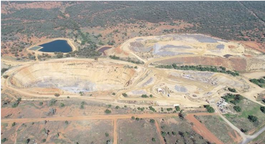
Mt Boppy Gold mine