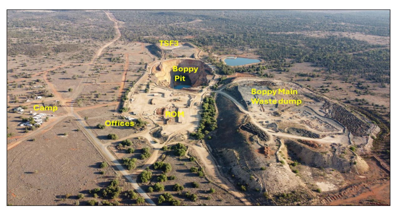
Figure 1: Drone image looking south showing the main components of the Rock Dump and Tailings Resources in relation to the Mt Boppy open pit.

A 26-borehole sonic drilling evaluation was completed on the Boppy Main Waste dump and the TSF3 impoundment including Potential Acid Forming (PAF) material overlying part of the tailings (Figure 1). The sonic evaluation drilling has enabled sampling of the full profile of the rock and tailings dumps, and thus assessment of the economic viability of treating crushed and screened rock dump fines and tailings on site at Mt Boppy.