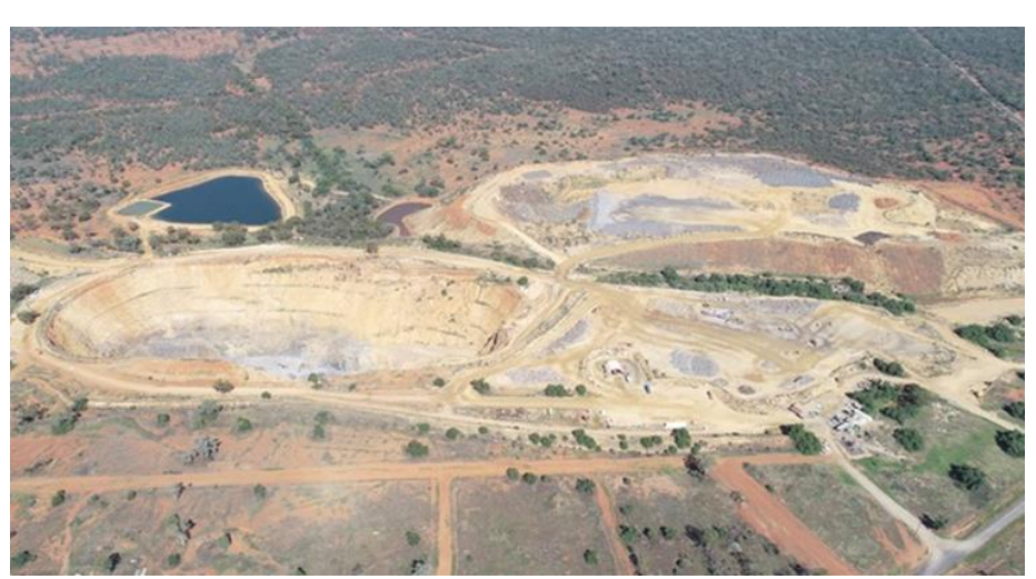
Mt Boppy Gold mine

The Company has to date processed its stockpiles and gold mineralised waste product through its Wonawinta plant. Manuka are currently pursuing a strategy of establishing of a fit-for-purpose, on-site crush-screen-mill-float facility to enhance the economics of the Mt. Boppy Mine and the value of near-mine prospects. The Mt Boppy site includes a 48-person mine camp and is fully permitted for the proposed processing plant and on-site production.