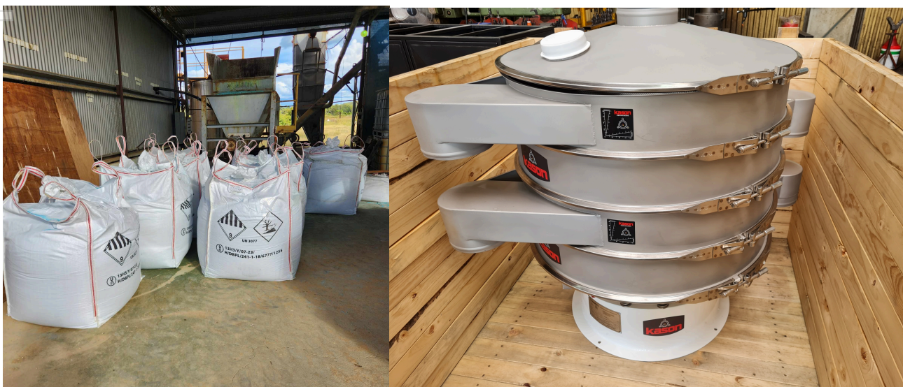
Figure 1. (Left) Production toward the second shipment. (Right) The new Kason Kason Vibroscreen Separator.

Plant reliability is improving, and the Company is recovering from both the challenges of the wet season and the deterioration of equipment such as the screen. The Company has purchased a new 3 Deck Kason Vibroscreen Separator from DTD Engineering, which will improve the product, enabling the sale of Tartana copper sulphate to premium markets with stricter product requirements. The bag scales are also being repaired to ensure constant bag weights.