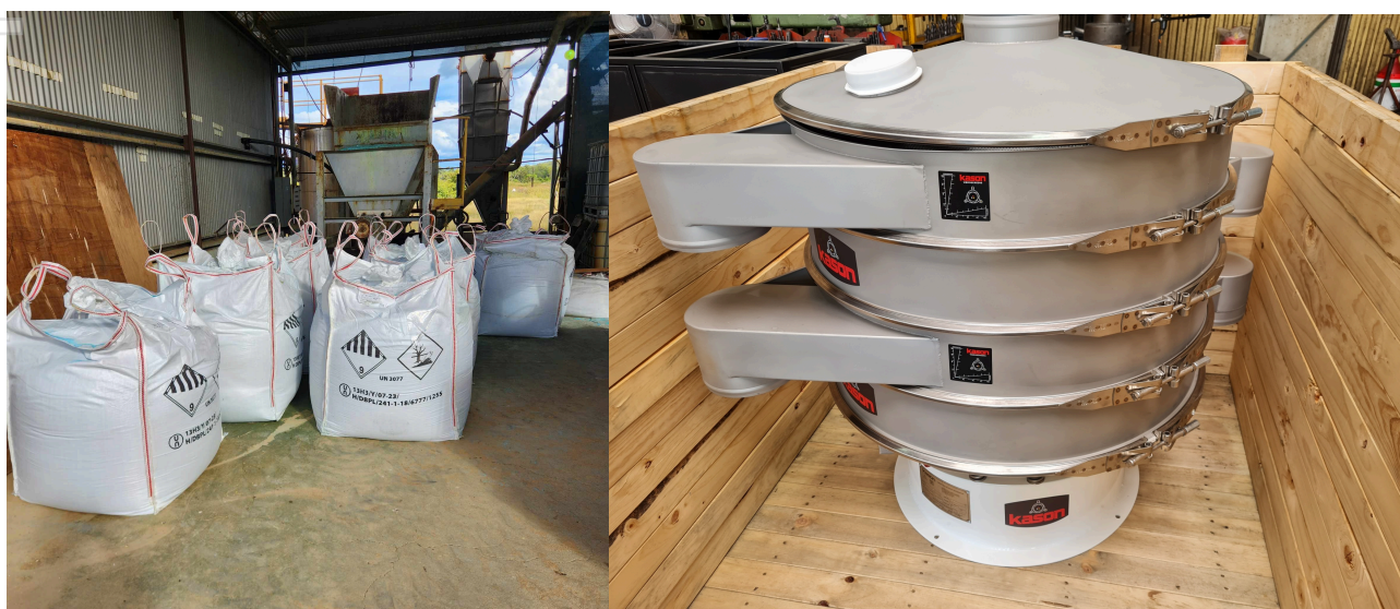
Figure 1. (Left) Production toward the second shipment. (Right) The new Kason Kason Vibroscreen Separator.

Plant reliability is improving, and the Company is recovering from both the challenges of the wet season and the deterioration of equipment such as the screen. The Company has purchased a new 3 Deck Kason Vibroscreen Separator from DTD Engineering, which will improve the product, enabling the sale of Tartana copper sulphate to premium markets with stricter product requirements. The bag scales are also being repaired to ensure constant bag weights.