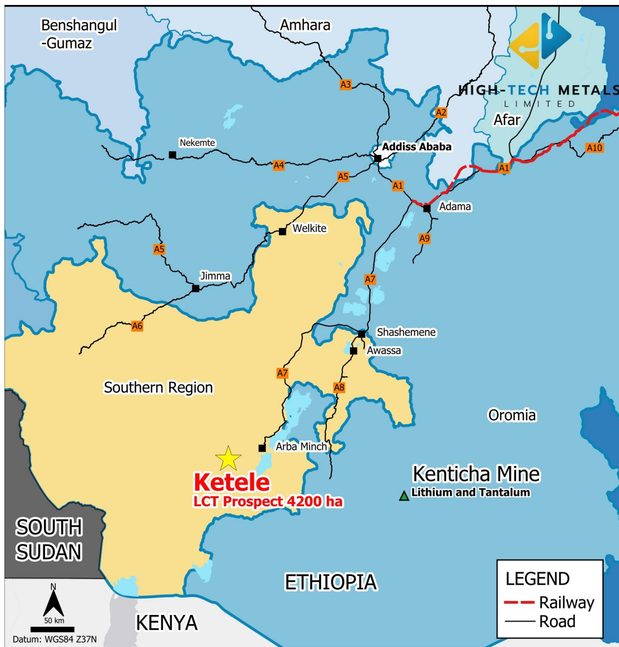
Figure 2 – Ketele LCT Project Location.