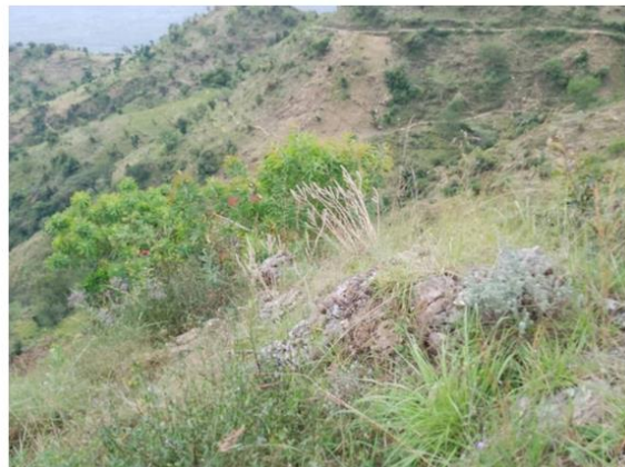
Figure 1 – Example of previously identified outcrops for the planned rock and channel sampling at the Ketele LCT Project.