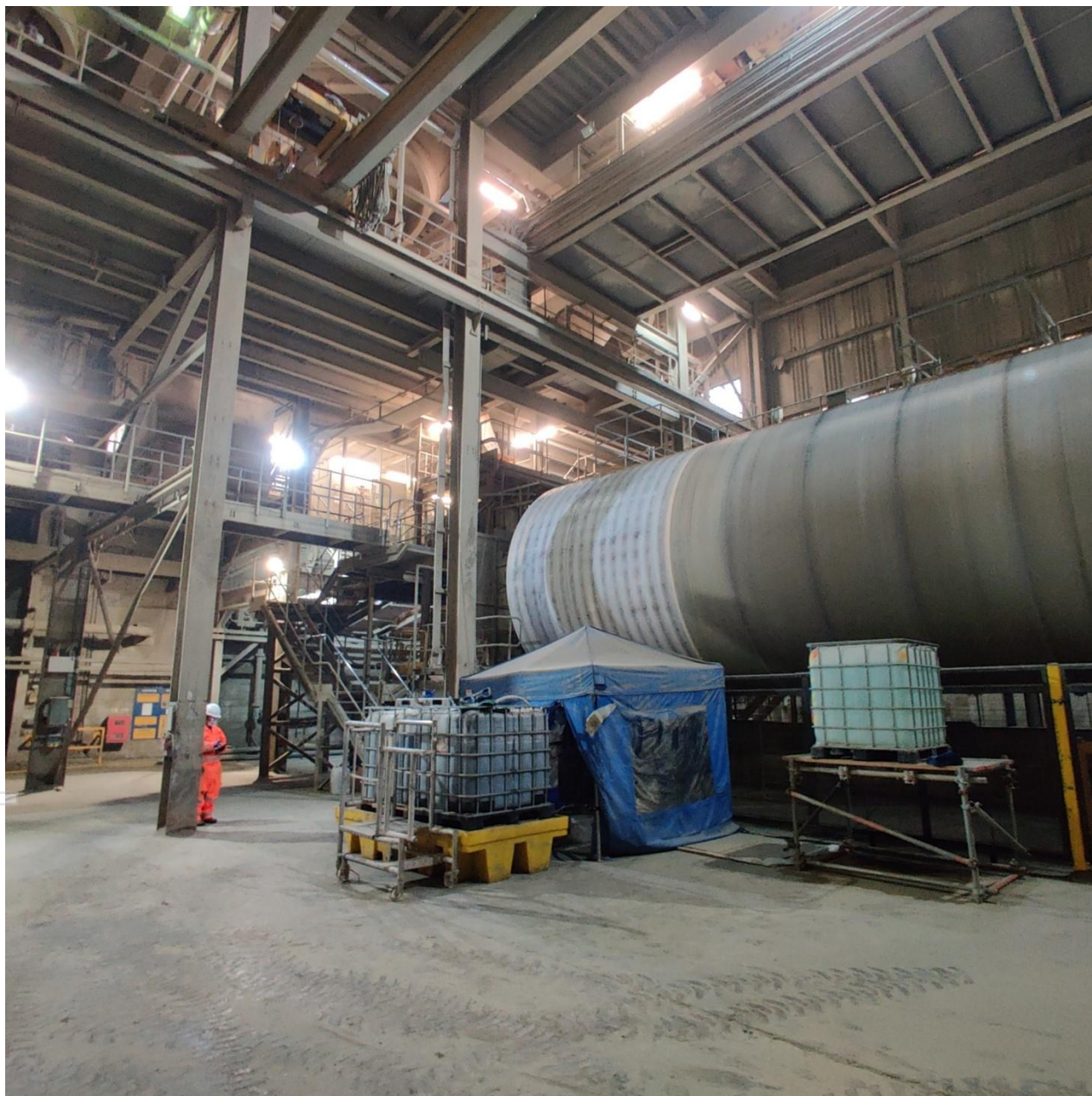
Image 1: Breedon Group's Hope Cement Works facility in the United Kingdom

This third trial will be planned and executed collaboratively with the Breedon site team, under the terms of the Joint Development and Commercialisation Agreement signed in 2023.