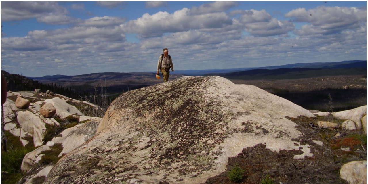
Figure 2. Geologist in the field at the Harrier Uranium Project.

The Company will potentially be able to obtain access to flow-through financing in Canada to fund future exploration activities at the Harrier Project.