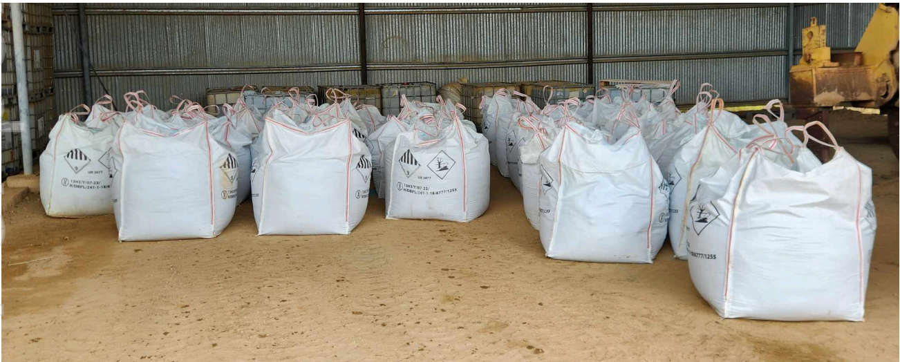
Above: Bags ready for shipment

R3D Resources Limited (ASX: R3D ) (the Company ), is pleased to advise that it has produced its first shipment of Copper Sulphate Pentahydrate ( Copper Sulphate ) which is ready for collection at the Tartana mine site. Minimum shipments are 28 bags weighing approximately 1.2 tonne each. The Copper Sulphate comprises 25% Copper and is priced at 25% of the LME copper price plus a premium.