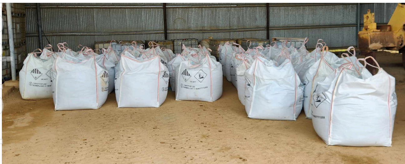
Above: Bags ready for shipment

R3D Resources Limited (ASX: R3D ) (the Company ), is pleased to advise that it has produced its first shipment of Copper Sulphate Pentahydrate ( Copper Sulphate ) which is ready for collection at the Tartana mine site. Minimum shipments are 28 bags weighing approximately 1.2 tonne each. The Copper Sulphate comprises 25% Copper and is priced at 25% of the LME copper price plus a premium.