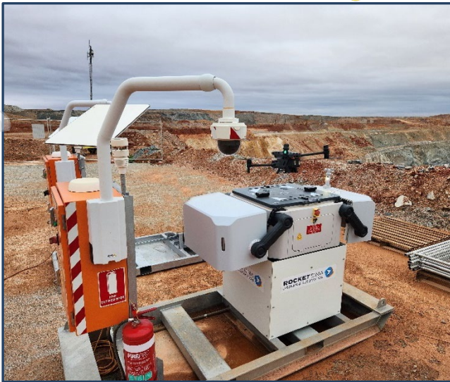
xBot® in operation at Red5, King of the Hills Mine