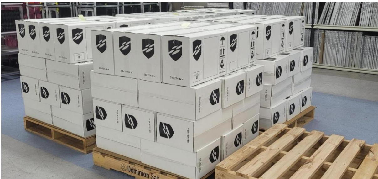
Image: DroneShield products ready for shipment