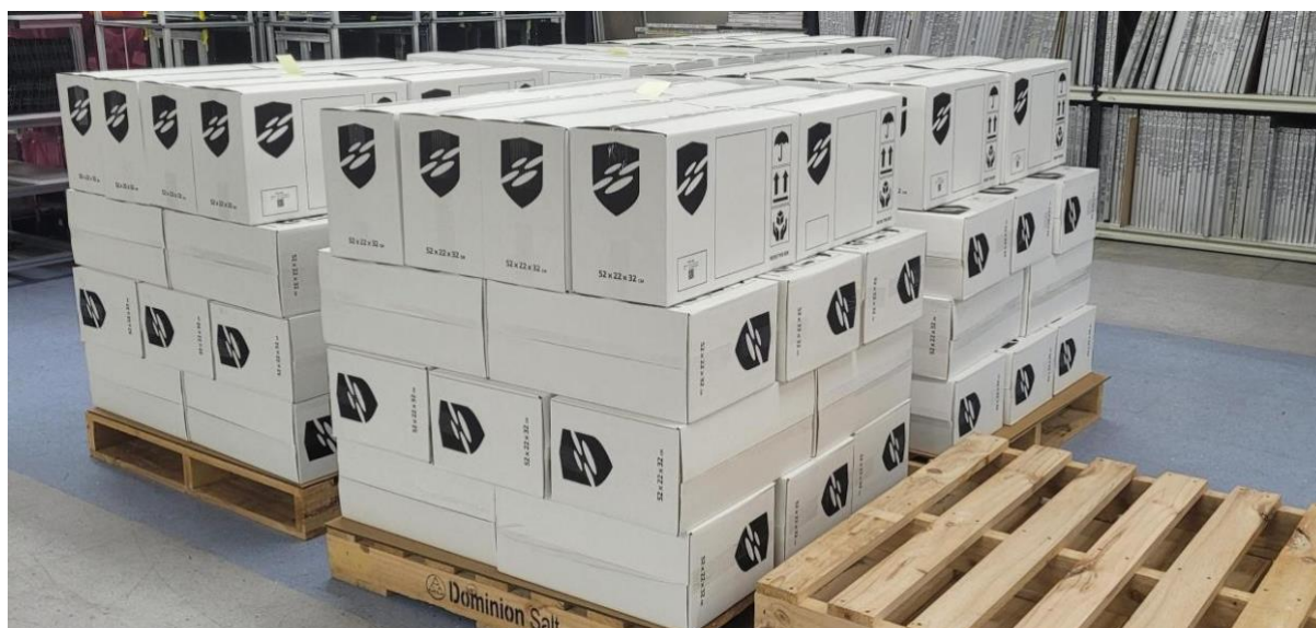
Image: DroneShield products ready for shipment